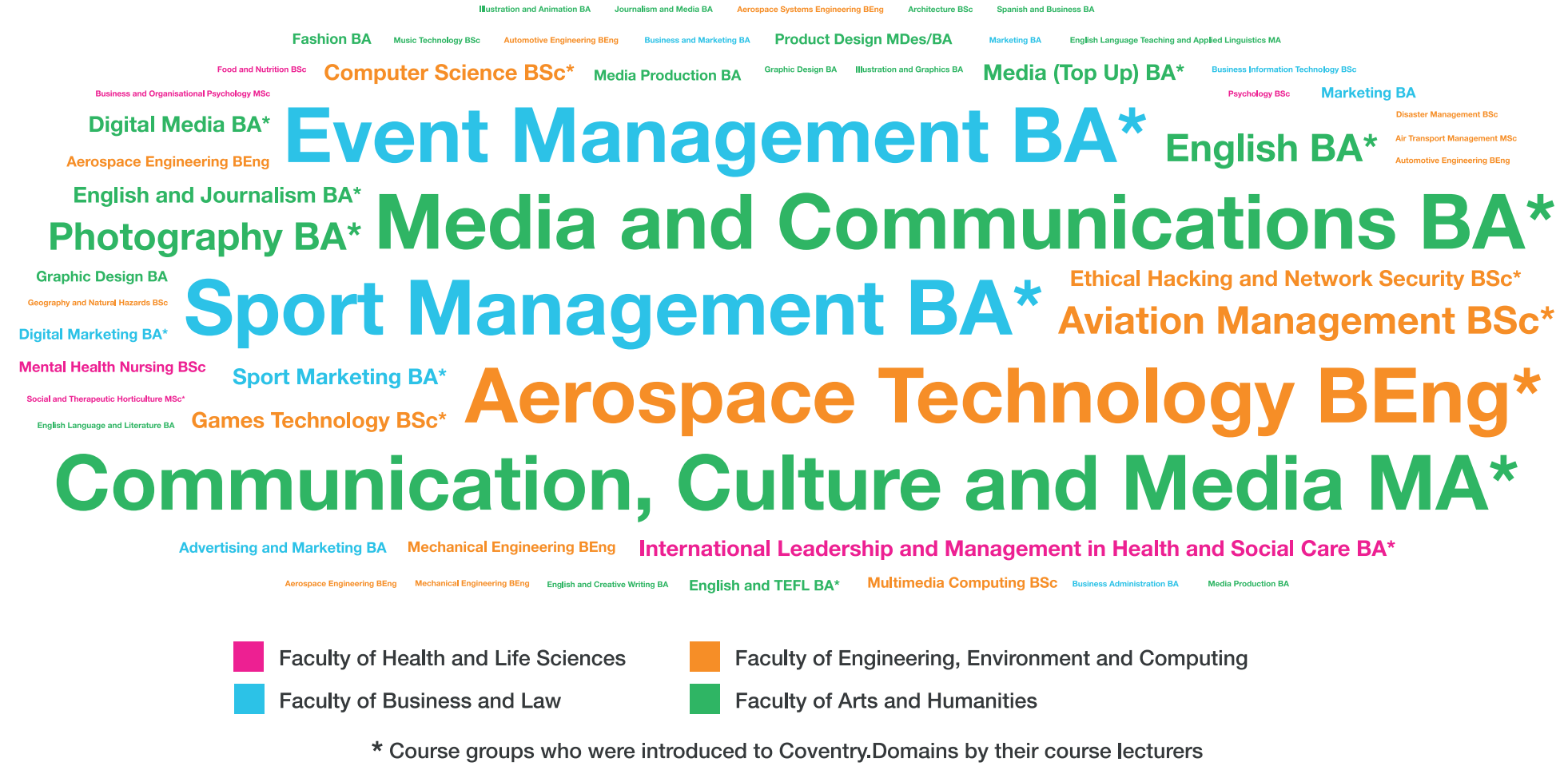
Fig 3: Course titles of users, with size of title indicating the size of user groups from each course and faculty.