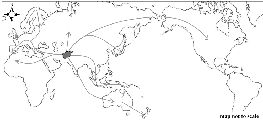
Map2: Flight from Home Country, Afghanistan

As shown in Map 2, Afghans had two choices when they fled from their home country. Firstly, they headed to Islamic countries, such as Pakistan, Iran, the UAE or Malaysia. Secondly, they chose non-Islamic countries, especially, in Western Europe or North America.