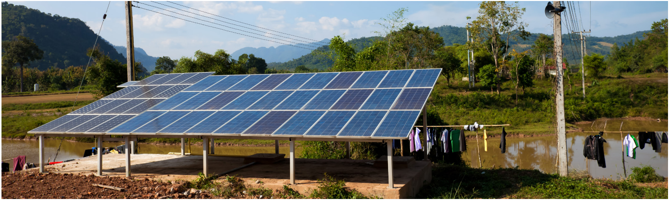
Solar panels in a backyard, Laos