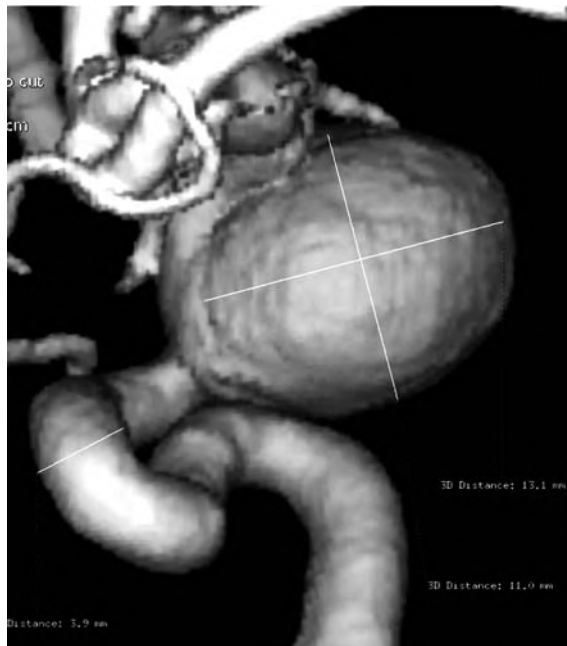
Fig. 1 Rotational 3D angiography showing a 11×13 mm internal carotid artery aneurysm. It was planned to treat the aneurysm by distal occlusion of the parent artery with coils