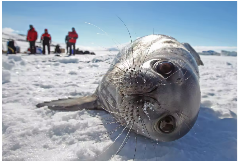
The endemic Antarctic Weddell seal resting on sea ice.

The more we learn about them, the more outstanding life at the end of the planetary spectrum becomes. Just this week, new scientific discoveries identified that some Antarctic bacteria live on air, and make their own water using hydrogen as fuel.