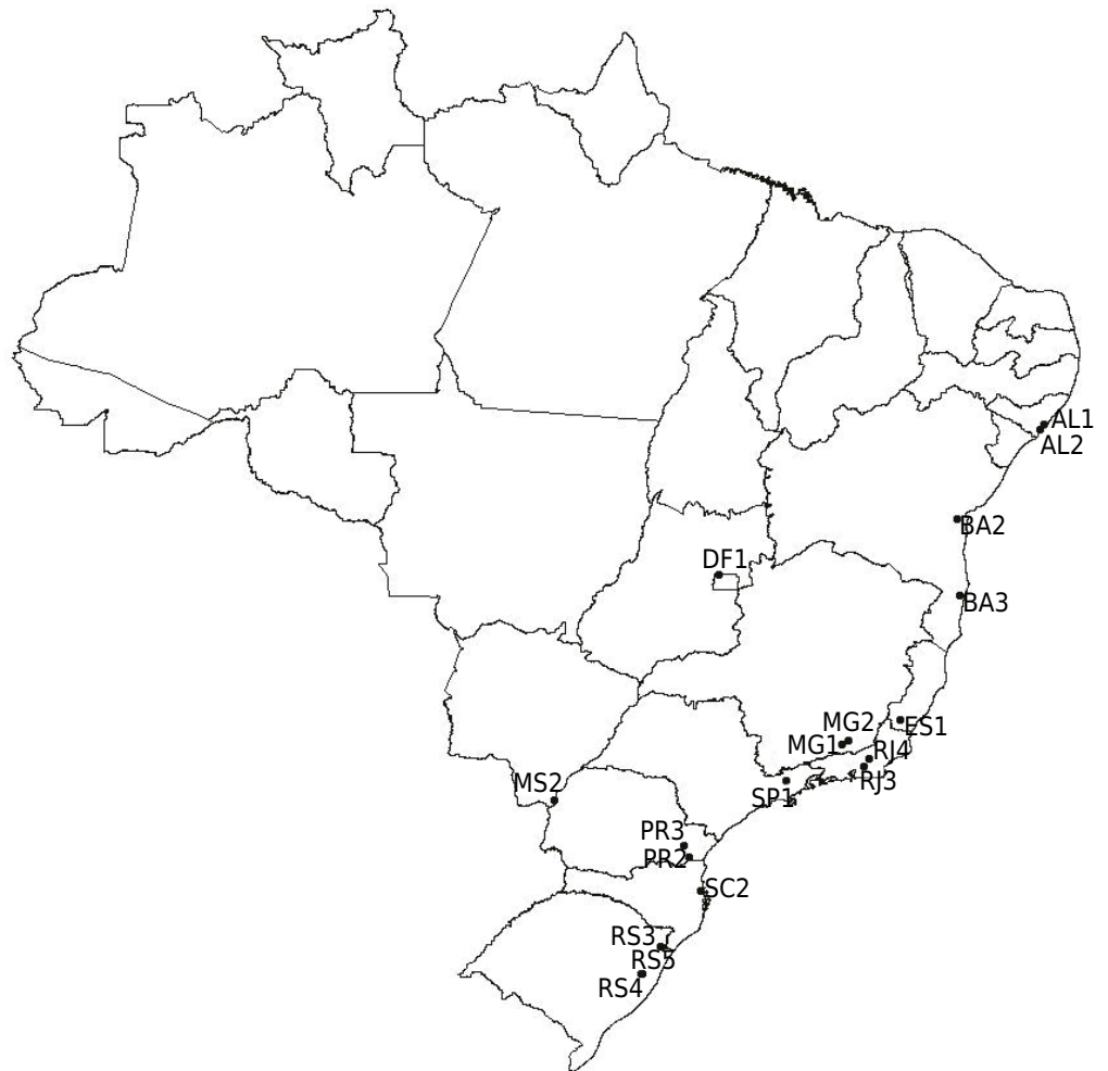
Figure 1. Distribution of Organosol profiles in Brazilian states.

Organic carbon (OC) in the FAF and HAF was determined in 5 mL extract aliquots mixed with 1.0 mL of 0.042 mol L -1 potassium dichromate and 5 mL of concentrated H 2 SO 4 in a block digester at 150 °C (30 min), followed by titration with 0.0125 mol L -1 ferrous ammonium sulfate. In the oven-dried residue, OC was determined in humin (HUM) by adding 5 mL of 0.1667 mol L -1 potassium dichromate and 10 mL of concentrated H 2 SO 4 to a block digester at 150 °C (30 min) and titrating with 0.25 mol L -1 ferrous ammonium sulfate and using ferroin indicator solution.