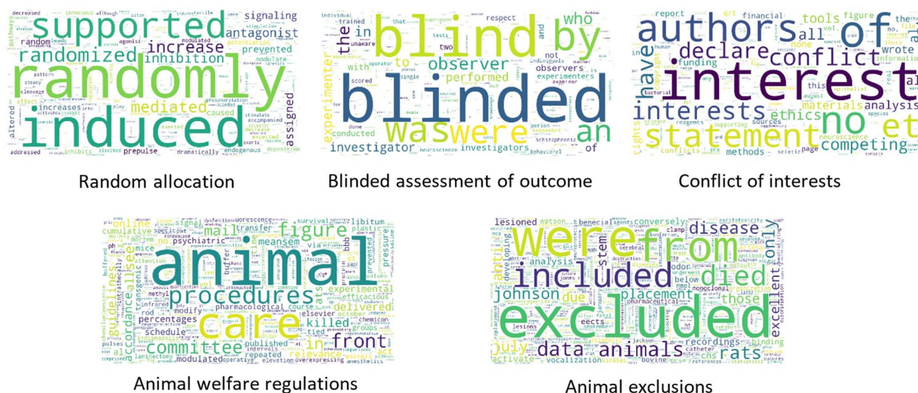
FIGURE 2 Most important words in the decision of classification for each risk of bias item, based on the average attention scores from RNN output over all positive samples [Colour figure can be viewed at wileyonlinelibrary.com ]

The tool and codes for predicting probabilities of risk of bias reporting in preclinical full texts is available at https://github.com/qianyingw/pre-rob . The levels of performance achieved make these tools suitable for research improvement activity where several hundred publications are to be evaluated. For instance, for