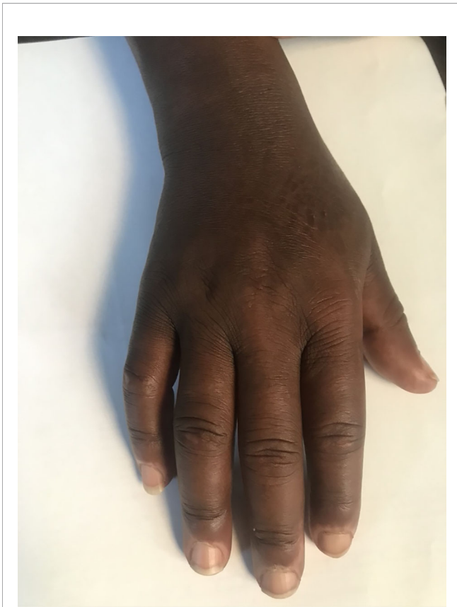
FIGURE 5 | Puffy fingers and cuticle hypo pigmentation in a child with detectable SSc specific autoantibodies.