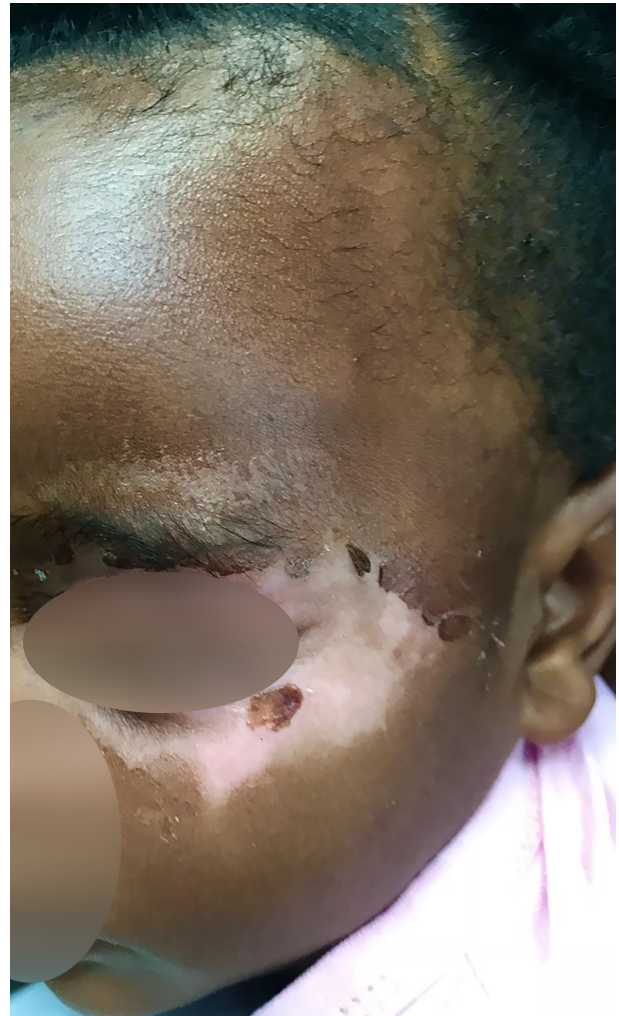
FIGURE 4 | Figure shows skin changes and alopecia in a child with detectable SSc specific autoantibodies.

The overall female predominance amongst adult patients (F:M=3.5:1) is comparable to other studies (17, 18). The median adult ages differed significantly along racial subgroups being lowest in Asians (31.5 years), Blacks (35 years) and highest in White (48 years) patients. This difference could explain the recognized earlier onset of SSc in Asian and Black patients. A remarkable finding of this study was that 20% of autoantibody positive patients were <16 years old (mean age 7.56, 95%CI 2.7-12). These were Black (45/48), Asian (2/48) and White (1/48). The racial differences suggest that the presumed rarity of SSc in children could be due to study biases that predominantly report findings in White but not Black patients. To our knowledge, this number of Black pediatric patients with symptoms suggestive of SSc and