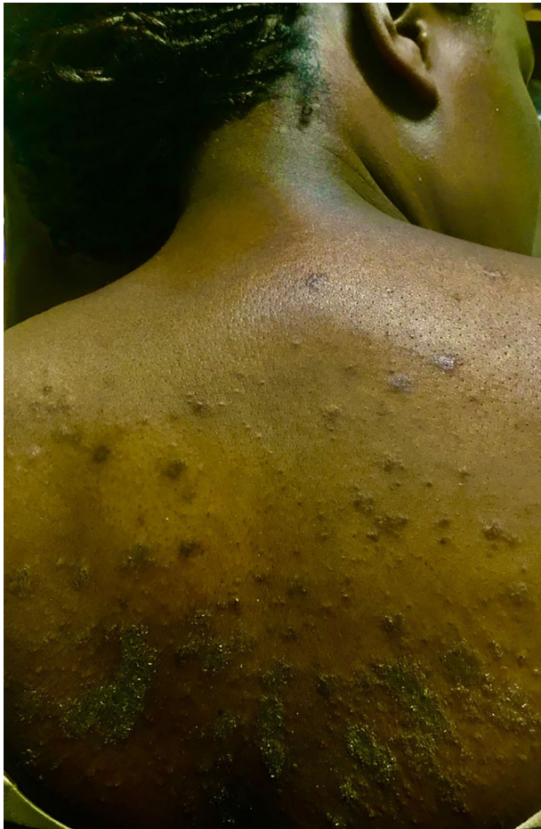
FIGURE 3 | Psoriasiform dermatosis in a patients with SSc specific autoantibodies.

autoantibodies and disease phenotypes was observed with respect to the respiratory and gastrointestinal tracts and thyroid abnormalities.