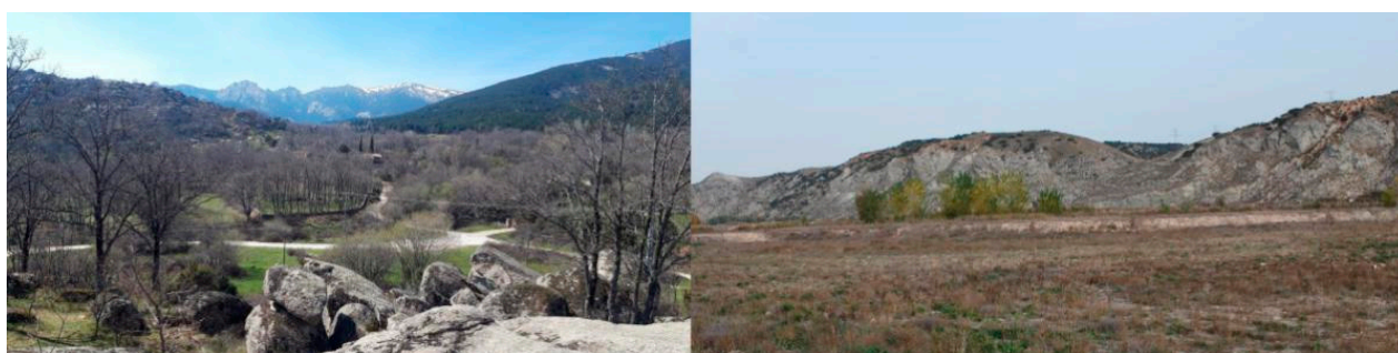
Figure 1. Typical scenes of the two landscapes.

landscape, forested and water-rich, the gypsiferous steppes form an undulating landscape, with an arid and dusty appearance spotted with sparse vegetation (Figure 1). Historically, and currently, Guadarrama has received more visitors and preference for its landscape than the type of landscape of plains with a mainly steppe-like appearance [5,47]. This may indicate that, in the exclusive framework of the enjoyment of landscape, users value more the ecological and esthetic characteristics of the former, but it may also be that they perceive and recognize these values more clearly.