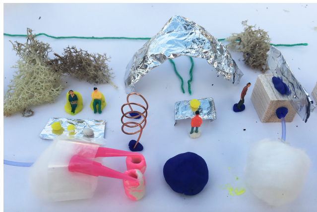
Figure 2: A set of low-fidelity objects to illustrate scenarios of design fiction. Documentation from Kim et al. [17]

Participants are invited to submit a short position paper (1-2 pages long, including references), briefly describing their research area