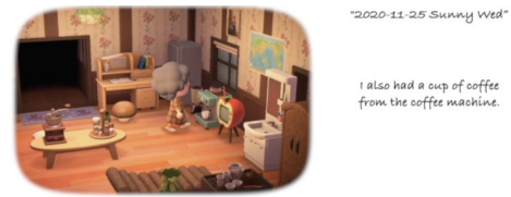
Figure 1: Use Animal Crossing [17] to produce an animated cinema based on timeline

very attractive. The animated cinema can use the perspective of the protagonist of the game to show the timeline of a household's use of electrical appliances in a similar home layout and thus adds a new narrative point to the timeline. For example, when the storytelling time now is 08:00 - 11:00, the producer could follow the timeline to control the protagonist in the game to watch TV and then record a certain length of video. Finally, the videos of different time periods are combined together to produce a collection to show this timeline and some diary subtitles from the first-person perspective can appear next to the animated cinema, so that the audience can vividly gain a feeling of the story, as depicted in Figure 1.