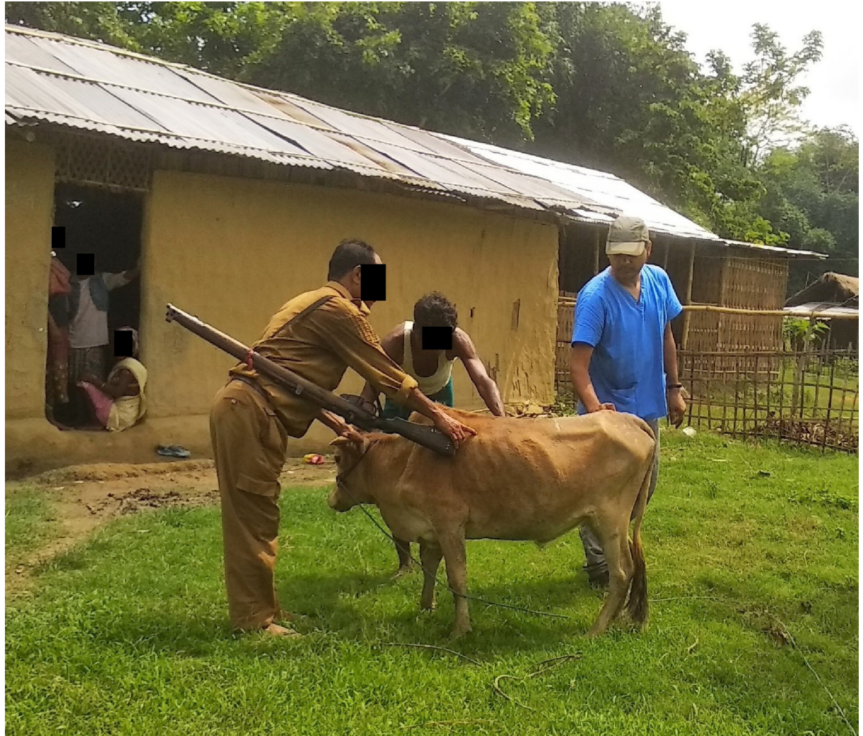
Fig 2. Vaccination team (Forest Dept/ TCF) visiting cattle in their own accommodation for immunisation near the Kaziranga National Park. Vaccination teams visiting every household in a village improves coverage as fewer animals are missed. Owners do not have the problem of restraining their animals in an open area; mixing of animals, which may spread disease, is reduced; and this approach facilitates dialogue between vaccinators and animal keepers.

https://doi.org/10.1371/journal.pone.0256684.g002