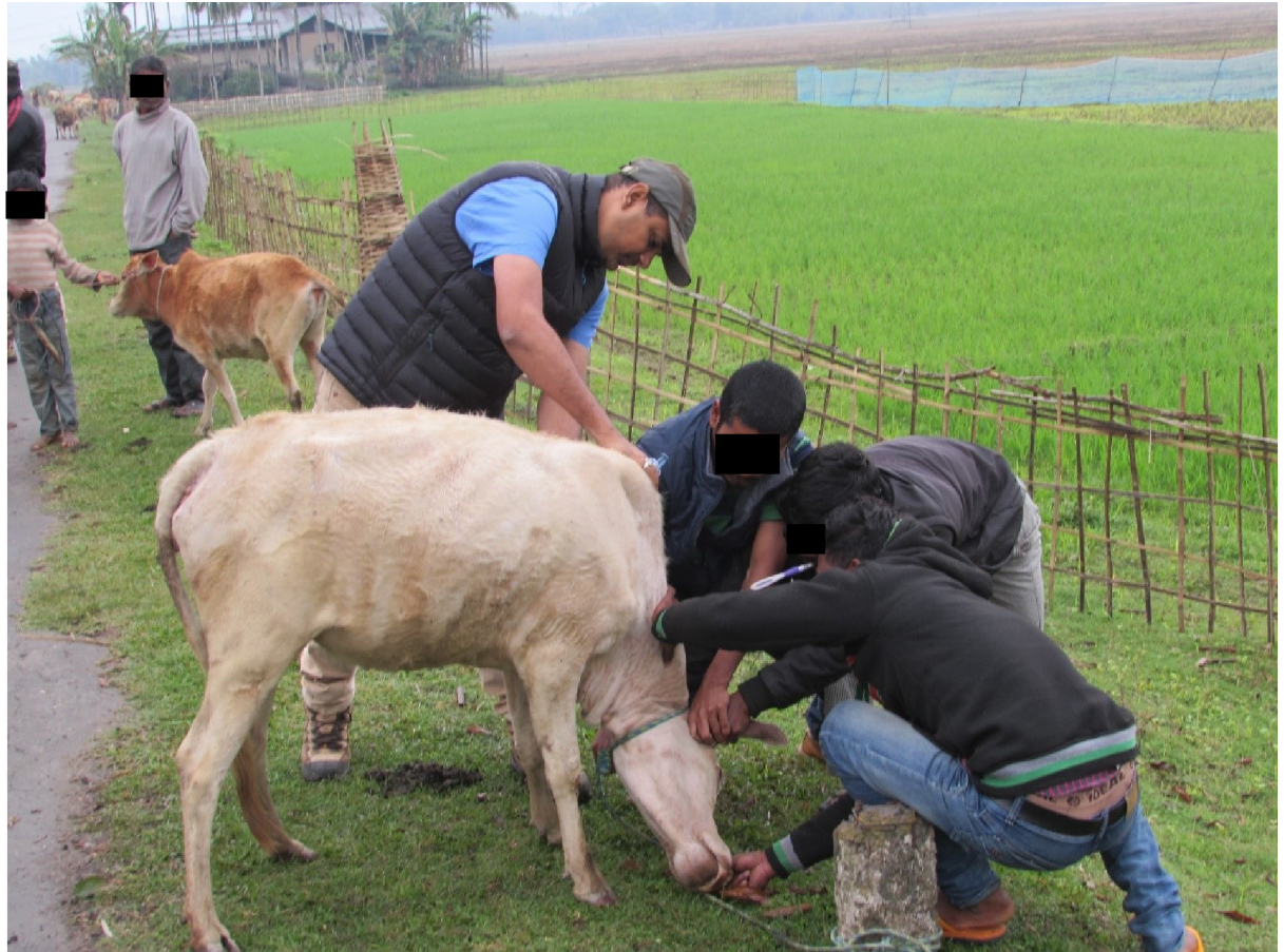
Fig 3. Cattle presented for vaccination at the roadside in front of the keepers house on the fringe of Kaziranga National Park, Assam. Presentation of livestock in front of the keepers home is an effective compromise, allowing vaccination teams to work efficiently. This is an example of the benefit of community engagement in the planning and undertaking of immunisation programmes.

https://doi.org/10.1371/journal.pone.0256684.g003