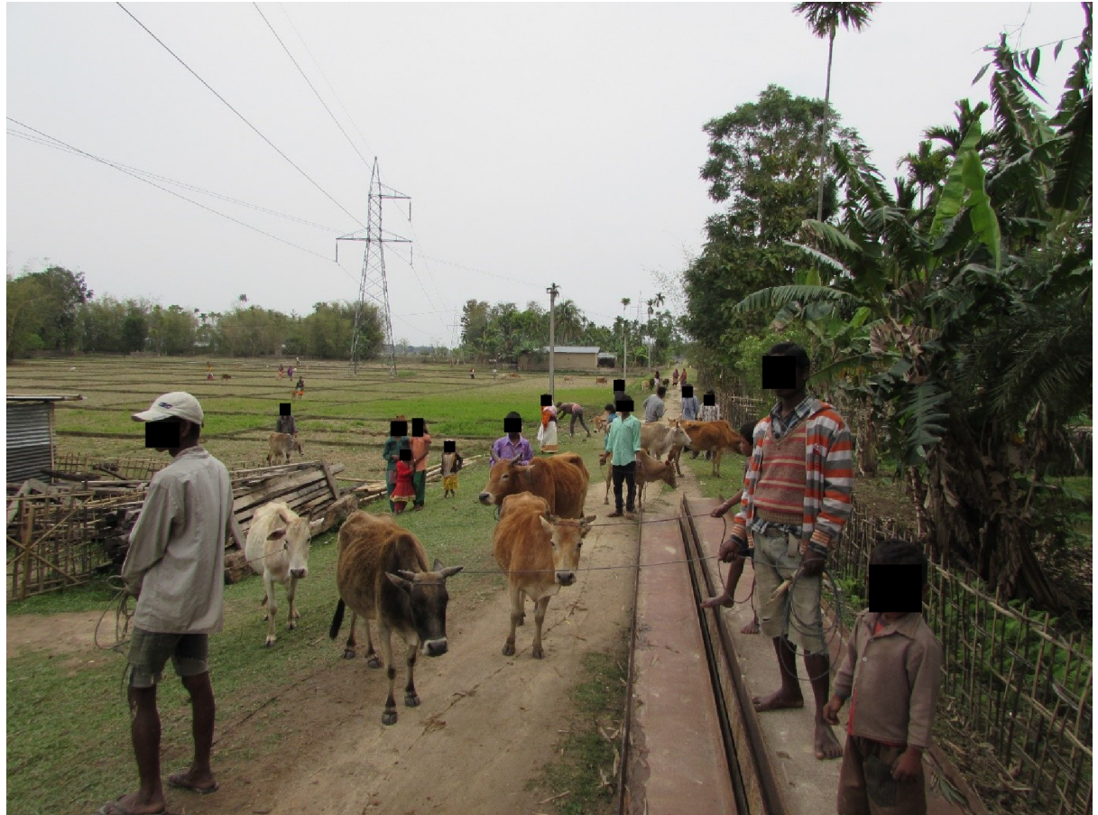
Fig 1. Cattle being gathered for foot and mouth vaccination. Vaccine drives may involve owners bringing their animals to a single site. These programmes are efficient in terms of animal health workers' time. However, some animals may be missed due to: long walking distances involved for people and their animals to reach the vaccination or treatment sites; difficulties in catching and restraining animals; or animal keepers being otherwise occupied at the time. It is noteworthy that small ruminants and pigs are not included in this foot and mouth vaccination drive. Furthermore, bringing animals together in this way could increase the risk of virus transmission, and spread of other production limiting infectious diseases.

https://doi.org/10.1371/journal.pone.0256684.g001