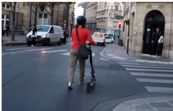
1.5 In the middle of the crossing, she turns her head to the road again