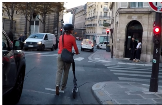
1.4 Instead of stopping she starts walking, turns her head to the right