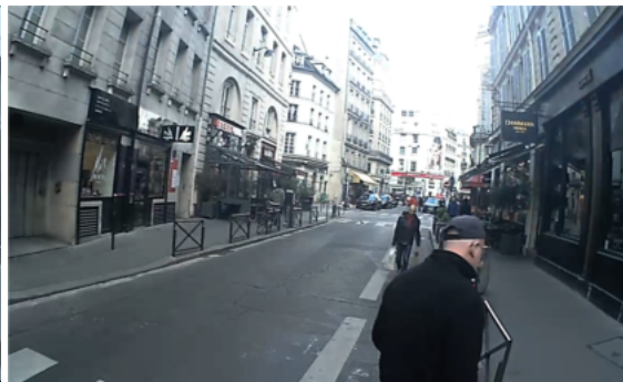
3.6 The pedestrian quickens his step to climb on the pavement