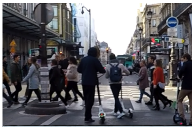
2.3 He starts walking, turns left on the zebra crossing