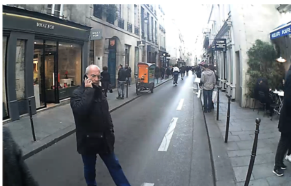
4.3 He raises his gaze to the e-scooter rider