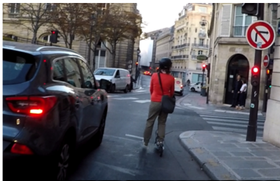
1.3 She sets foot as she reaches the boundary