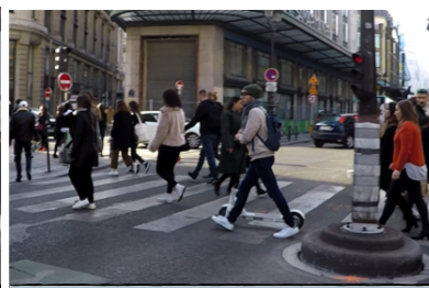
2.4 He walks along with pedestrians