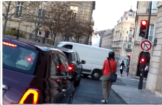
1.2 She slows down as she comes closer