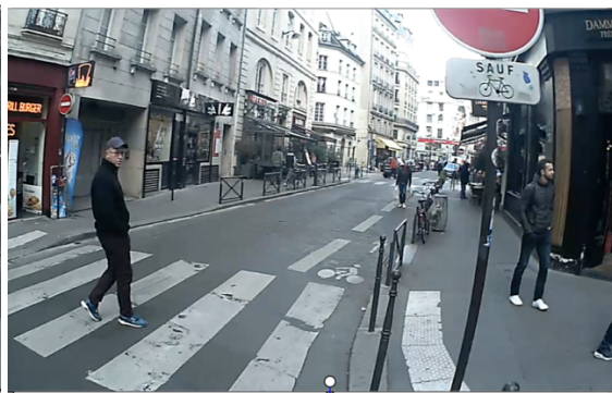
3.4 ... and suddenly brakes on his right leg