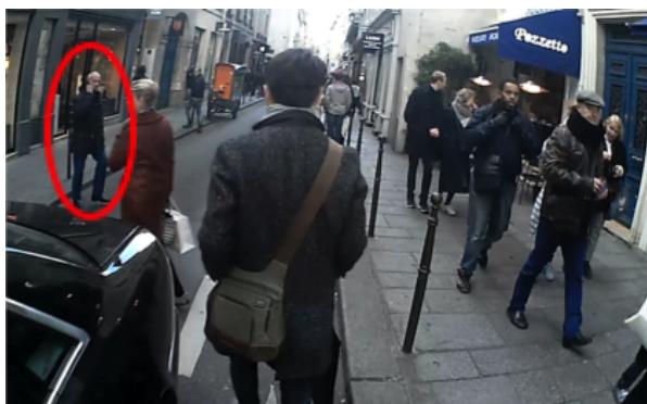
4.1 A pedestrian engages on the road on Vincent's left