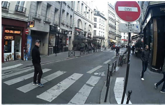
3.3 The pedestrian turns his head to Vincent...