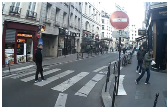
3.2 Vincent slows down, ready to let the pedestrian go first