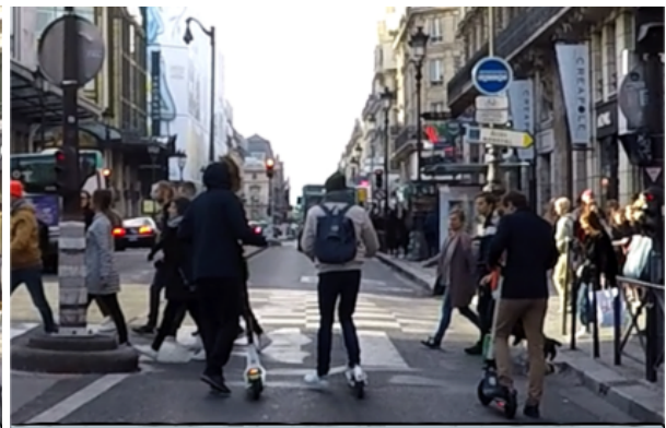
2.2 He sets foot as he reaches the boundary