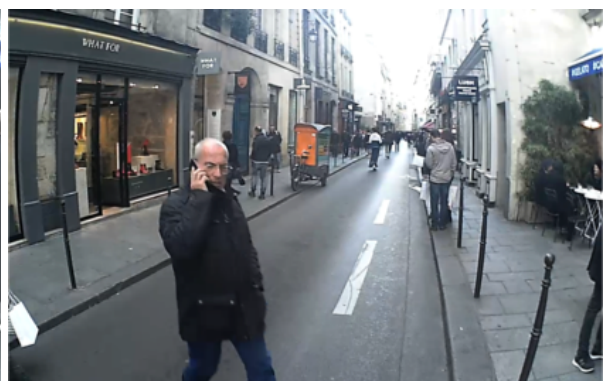
4.4 He breaks on his left foot