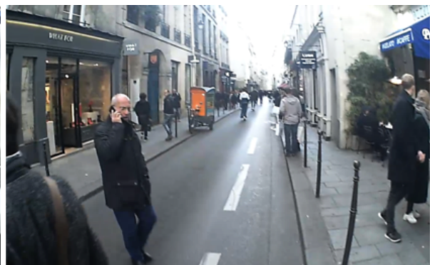
4.2 The pedestrian approaches Vincent's way, still looking down