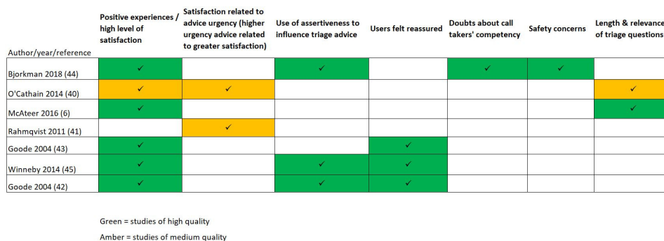
Figure 3 Key themes from studies of user experience.

This systematic review has evaluated the evidence on how telephone-based digital triage affects wider healthcare service use, clinical outcomes and user experience in urgent care. Thirty-one studies were included, covering a range of different designs, settings, populations and digital triage systems. Studies typically showed no change