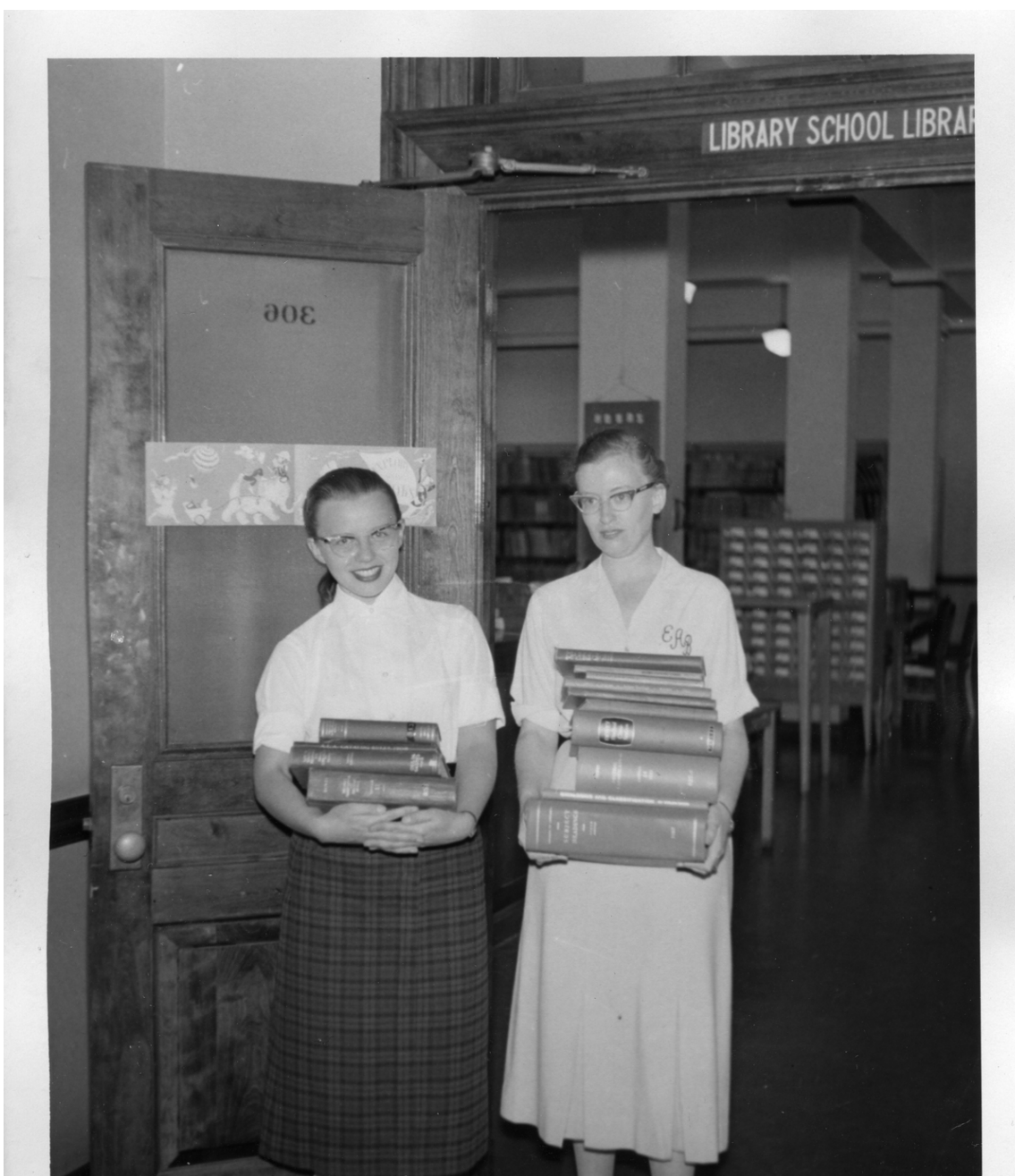
ca. 1954

Whatever else we may be, we have always been at our best when we have understood ourselves as "pioneers."