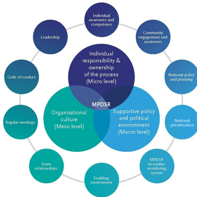
Figure 1. Framework for overcoming blame culture to promote a positive implementation culture for MPDSR.