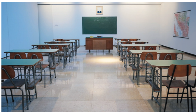
Photo: From the exhibition The Nineties: A Glossary of Migrations .

survey of 730 US parents of school-aged children, school refusal was associated with parental fear of their child's susceptibility to COVID-19 multi-systemic inflammatory syndrome [5].