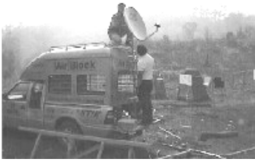
Picture 4. Installation of a Ku band antenna