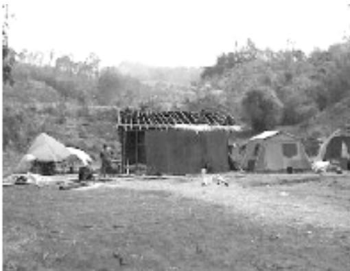
Picture 3. Elementary school (under contraction); Now this construction is used as a kindergarten (private communication from Yoshida M.).