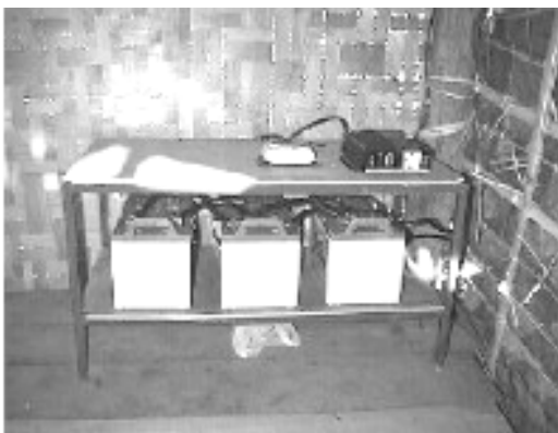
Picture 8. Installed charge controller, inverter, and batteries