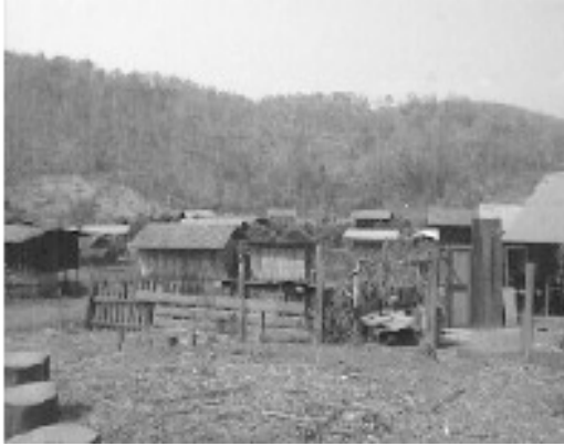
Picture 1. Ban Nong Pha Jam Mai