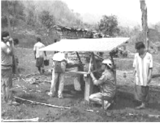
Picture 7. Installation of solar modules