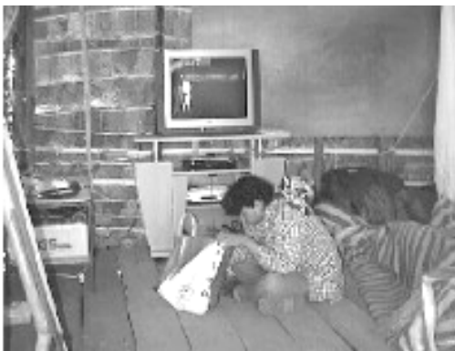
Picture 6. Installation of a TV set