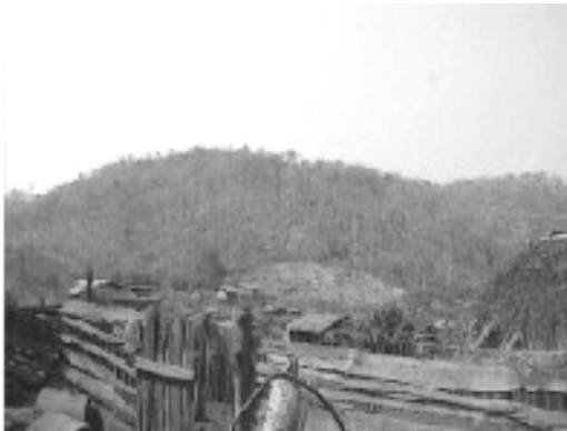
Picture 2. Ban Nong Pha Jam Mai