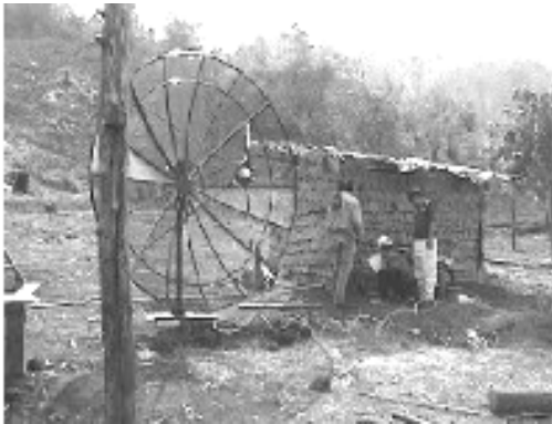
Picture 5. Installation of a C band antenna