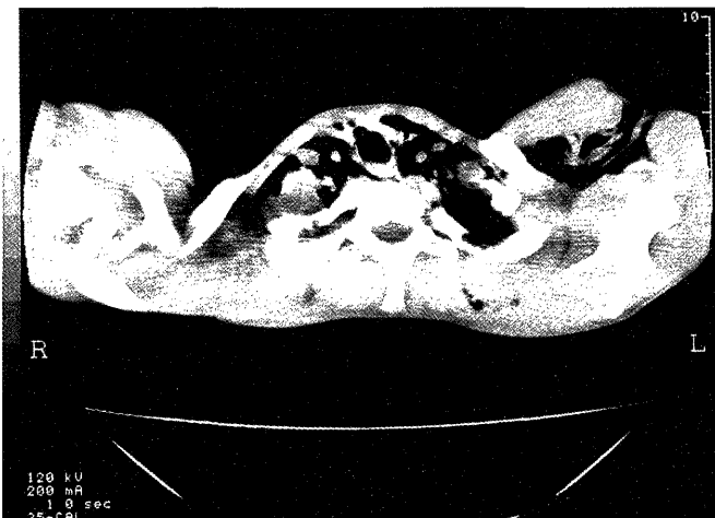
Figure 2. Chest CT scan confirmed extensive subcutaneous emphysema in the neck, the left axillary portion, and the pneumomediastinum.