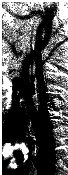
Fig.4. Left cervical carotid angiogram showing the complete obliteration of the false lumen and the patency of the internal carotid artery nine months after the procedure.

were confirmed on the follow-up carotid angiogram nine months after stenting (Fig. 4).