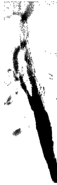
Fig.3. Lt.carotid arteriogram showing the disappearance of pseudoaneurysm packed with Guglielmi detachable coils (GDCs) through the stent mesh two days after stenting. (GDC10. Soft. 3mm×6cm+2mm×4cm)

anesthetic and a light neuroleptics, continuous neurological monitoring was performed during the procedure,