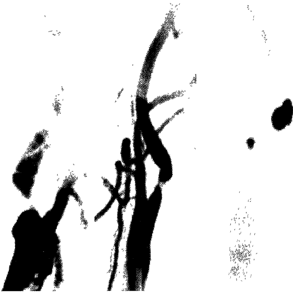
Fig.1. Right cervical carotid angiogram showing severe stenosis of the internal carotid artery (left). Left cervical carotid angiogram showing severe stenosis of the internal carotid artery (middle). Three-dimensional CT (maximum intensity project image) showing calcification at the stenotic lesion of the left internal carotid artery (right).