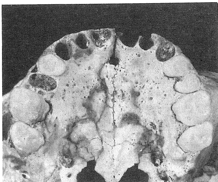
Fig. 1 Occlusal aspect of maxillary dentition of Tomari cave man.

Fig. 1 shows the occlusal aspect of the remaining teeth with the dental arch of Tomari cave man. A detailed description of the morphology of the teeth was reported by Ogata et al (1989) 3) . The teeth were slightly worn away and showed