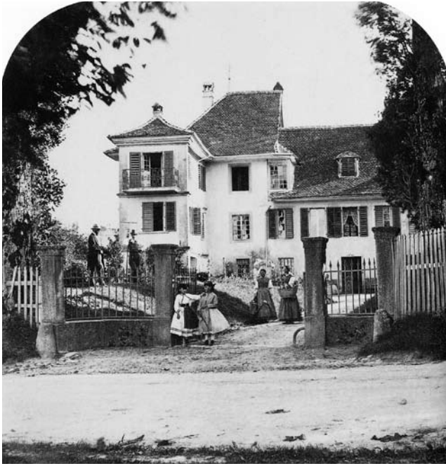
Fig. 15 Pierre Rossier: A family in Freiburg, Switzerland. Albumen-print stereoview, 83 x 174mm. ca. 1871.

photographer to traverse the Far East taking photographs: “Rossier Pierre, 1er photographe ayant parcouru les Indes. decede à Paris.” This means that Rossier died in Paris sometime between 1883 and 1898. 24