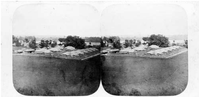
Fig. 9 Pierre Rossier: 'Yakuama. [Yokohama] General view of Yakuama.' No.72, 1859, albumen-print stereoview, 83 x 174mm. This series contained three Yokohama photographs – the earliest known.