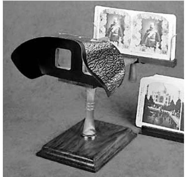
Fig. 3 A standard Victorian-era stereoscope. Viewing stereoviews through the device creates a surprising illusion of three-dimensionality.

"CHINA IN THE STEREOSCOPE – Messrs. Negretti and Zambra, the well-known photographic artists of Holborn-hill and Hatton-garden, have published a