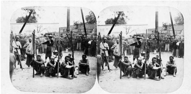
Fig. 5 Pierre Rossier: ‘Canton. Group of Coolies, or Street Porters.’ No.54, ca.1858-60, albumen-print stereoview, 83 x 174mm