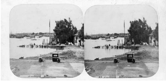
Fig. 4 Pierre Rossier: ‘Canton. The Landing Place, Taken from the House of the Commissariat.’ No.6, 1858, albumen-print stereoview, 83 x 174mm [‘NZ’ scratched into negative]