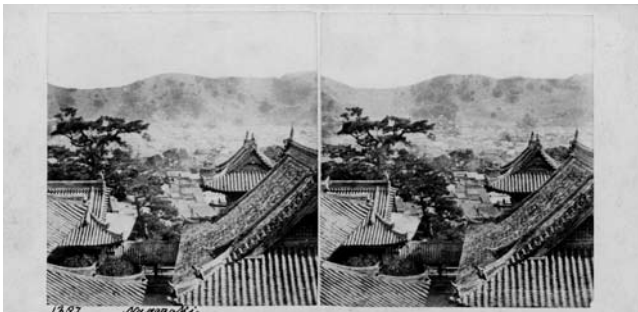
Fig. 11 Pierre Rossier: 'Panorama of Nagasaki.' No.1-5, 1860, albumen-print stereoview, 83 x 174mm. This second series contained a five-part panorama of Nagasaki of which this view is one part. Whereas the Rossier first series was concentrated around Tokyo and Yokohama, the second series centred on Nagasaki.

of Rossier's China views and also a competing set of stereoviews from Shanghai. Neither photographer's name is mentioned, but it is clear from the text that Rossier's photographs in Canton were being considered, and that they pre-dated those from Shanghai which we now know were taken by the Frenchman, Louis Legrand. It is apparent from reading the article that even as late as March 1860, photographs of China were seen as something of a novelty – at least in France. 14