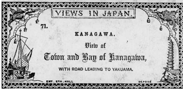
Fig. 2 Back of Negretti & Zambra stereoview.

until 19 th November 1859 when a set of fifty views were registered for copyright purposes at Stationers' Hall, London. 8 As we can see from the back of one of these stereoviews, the set may also have been registered in France. (Fig.2) Note also the complete absence of the photographer's or publisher's name. Because of this, photo-historians have struggled, until recently, to understand the significance of this set of views. The reason for this anonymity was that although Negretti and Zambra were publishers and retailers of stereoviews this was not, by any means, their main line of business. They much preferred to 'wholesale' the views by employing distribution partners in both Europe and America. By not showing the Negretti and Zambra company name on the stereoviews, distributors would be able to add their own. For example, the London Stereoscopic Company was by far the largest distributor of stereoviews in England, and their blind-stamped imprint on Negretti and Zambra's work has caused authorship confusion in the past.