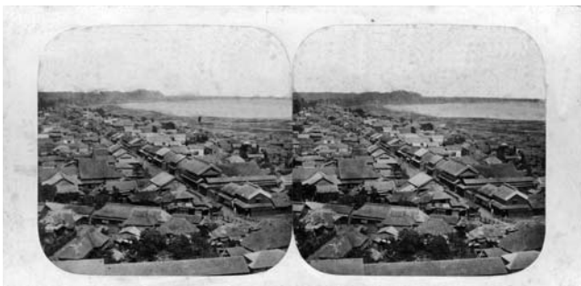
Fig. 10 Pierre Rossier: 'Kanagawa. General View of Kanagawa.' No.69, 1859, albumen-print stereoview, 83 x 174mm. This series contained four Kanagawa photographs – the earliest known.