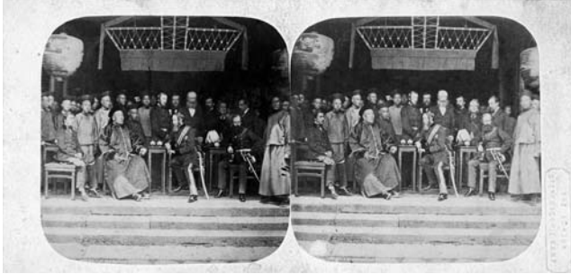
Fig. 12 Pierre Rossier: 'Canton. Farewell Visit of Gen. Sir Charles Straubenzie to the Chinese General-in-Chief.' No.47, 1860, albumen-print stereoview, 83 x 174mm [Blind-stamp: 'The London Stereoscopic Company' appears on the mount]