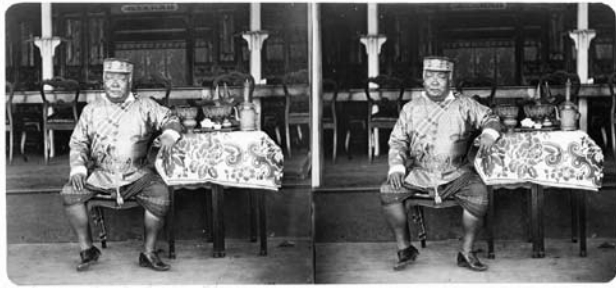
Fig. 14 Pierre Rossier: 'Siamese Prince. Luhang Wongsā.' No.3, 1861, glass stereoview, 83 x 174mm. Part of a Negretti and Zambra series of thirty views and portraits taken in Thailand.

ordered 200 and sent them to London for sale. 19