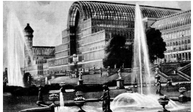
Fig. 1 The Crystal Palace, Sydenham, London, ca. 1854.

We have no idea what he did for the next three years, but in June 1858 the China Mail newspaper lists him as a passenger on his way to Hong Kong from Bombay, present-day Mumbai. He arrived on July 7 th , 1858 and