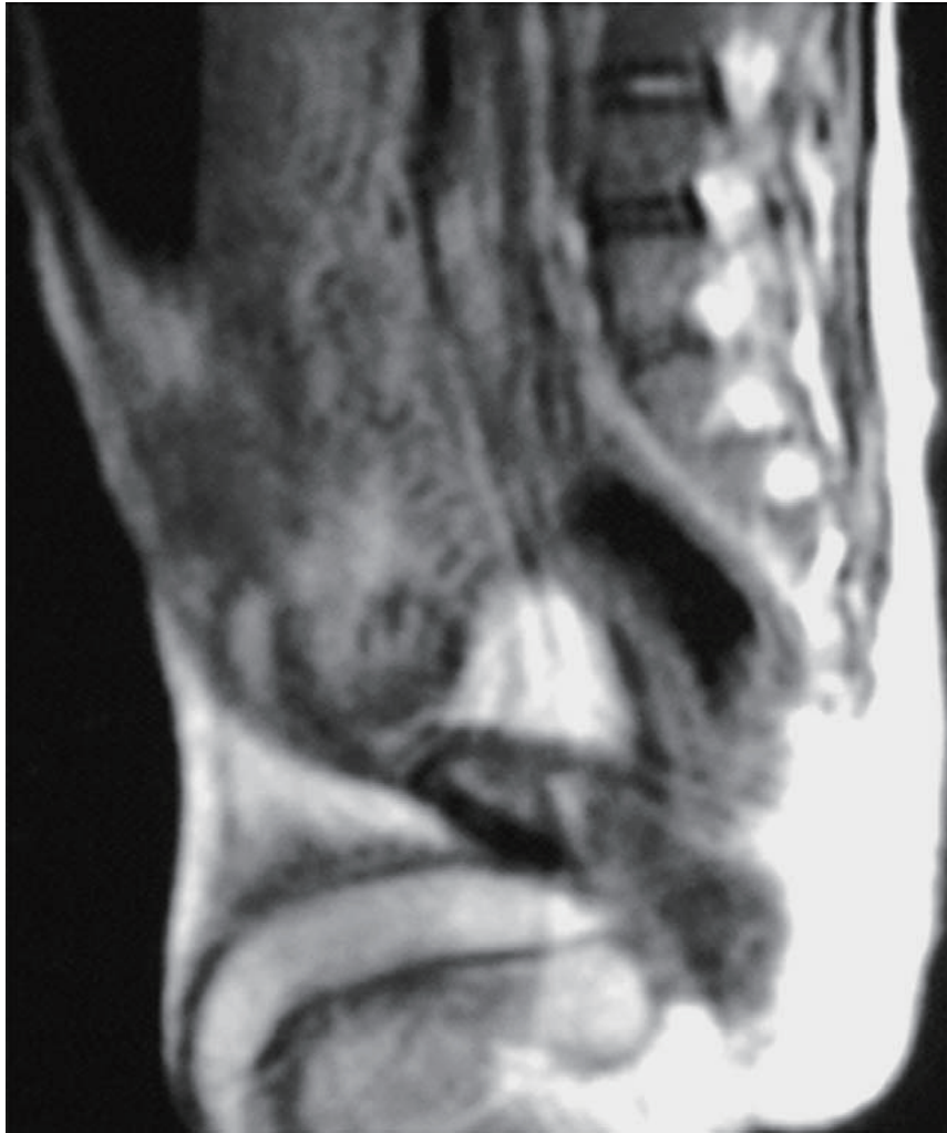
Fig.3 MRI showing neither masses nor tumors around anorectal region. There were no abnormal findings in the sacrococcygeal region.