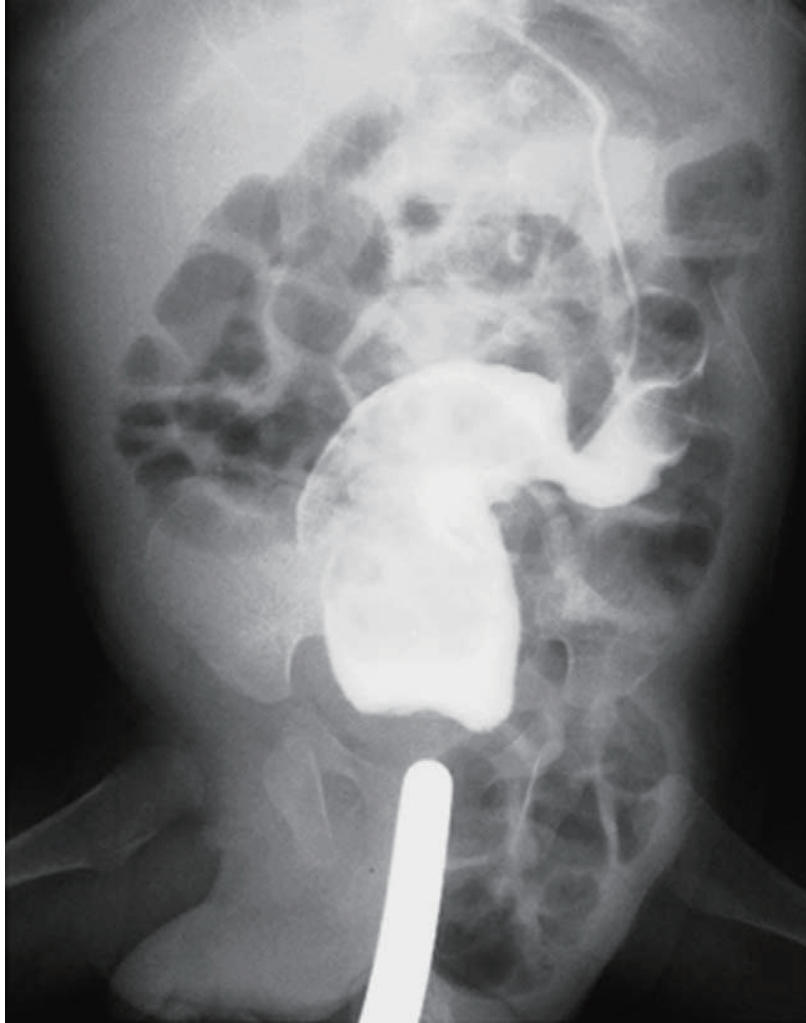
Fig.2 Barium contrast fluoroscopy examination revealing thick septum of the middle rectum (white arrow).