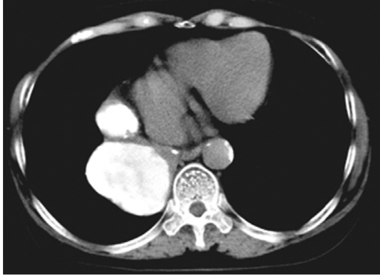
Fig. 3: Chest CT showing two white masses.