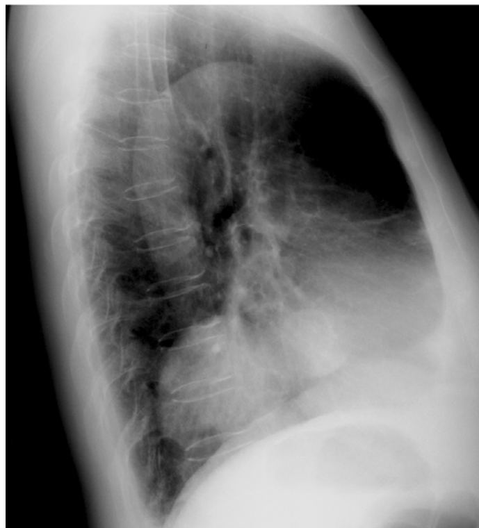
Figs. 1 and 2: PA and lateral chest radiographs showing two round opacities in the right lower lung field, simulating mediastinal tumors.