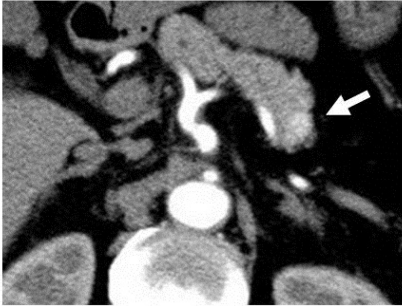
Figure 1. Contrast-enhanced CT scan of the 15-mm-diameter mass of the pancreatic body (arrow).