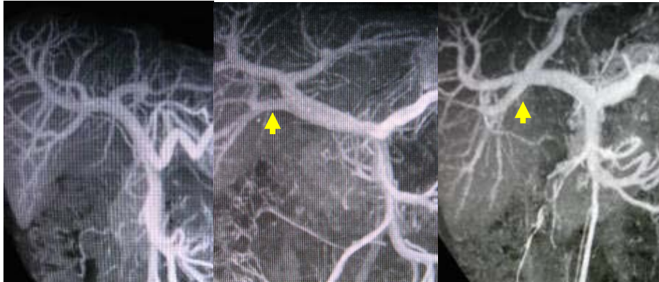
Fig.2 Classification of the portal vein