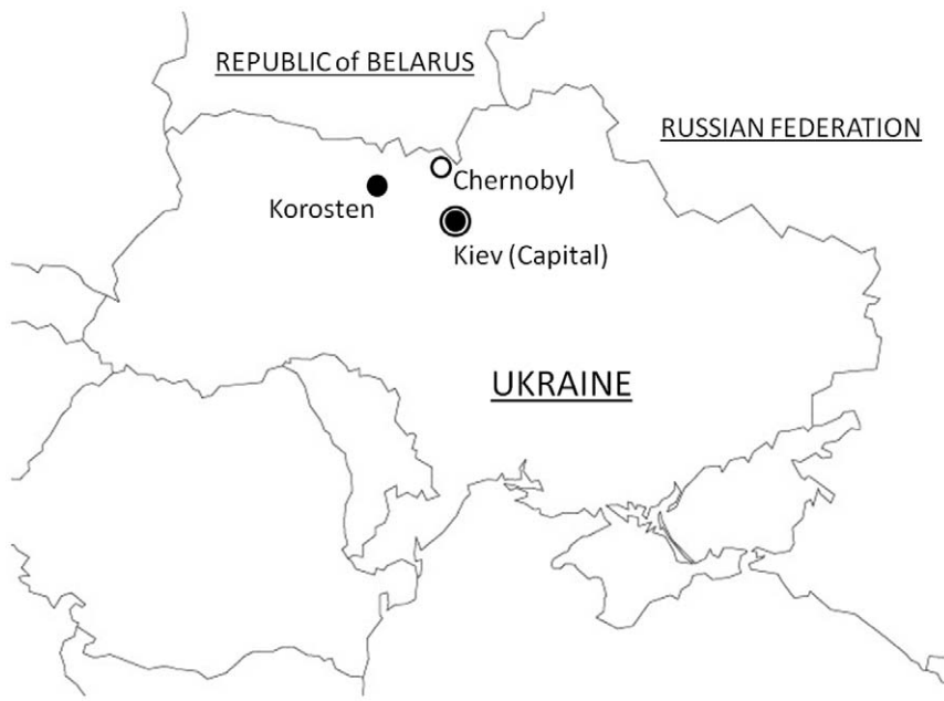
Figure 1. Location of Korosten, Ukraine relative to the Chernobyl Nuclear Power Plant (CNPP). doi:10.1371/journal.pone.0050648.g001

exposed to fallout from nuclear testing, or those exposed to emissions due to nuclear weapons production [5,6]. Also, Imaizumi et al. reported that among atomic bomb survivors in Hiroshima and Nagasaki, a significant linear dose-response relationship was observed for the prevalence of all solid nodules: not only malignant tumors, but also benign nodules and cysts [7]. Although these results suggest that both internal and external radiation exposure appear to increase the risk of development of thyroid nodules, prognosis in patients with benign thyroid nodules exposed to radiation, i.e., the possibility of “malignant transformation,” has not been evaluated.