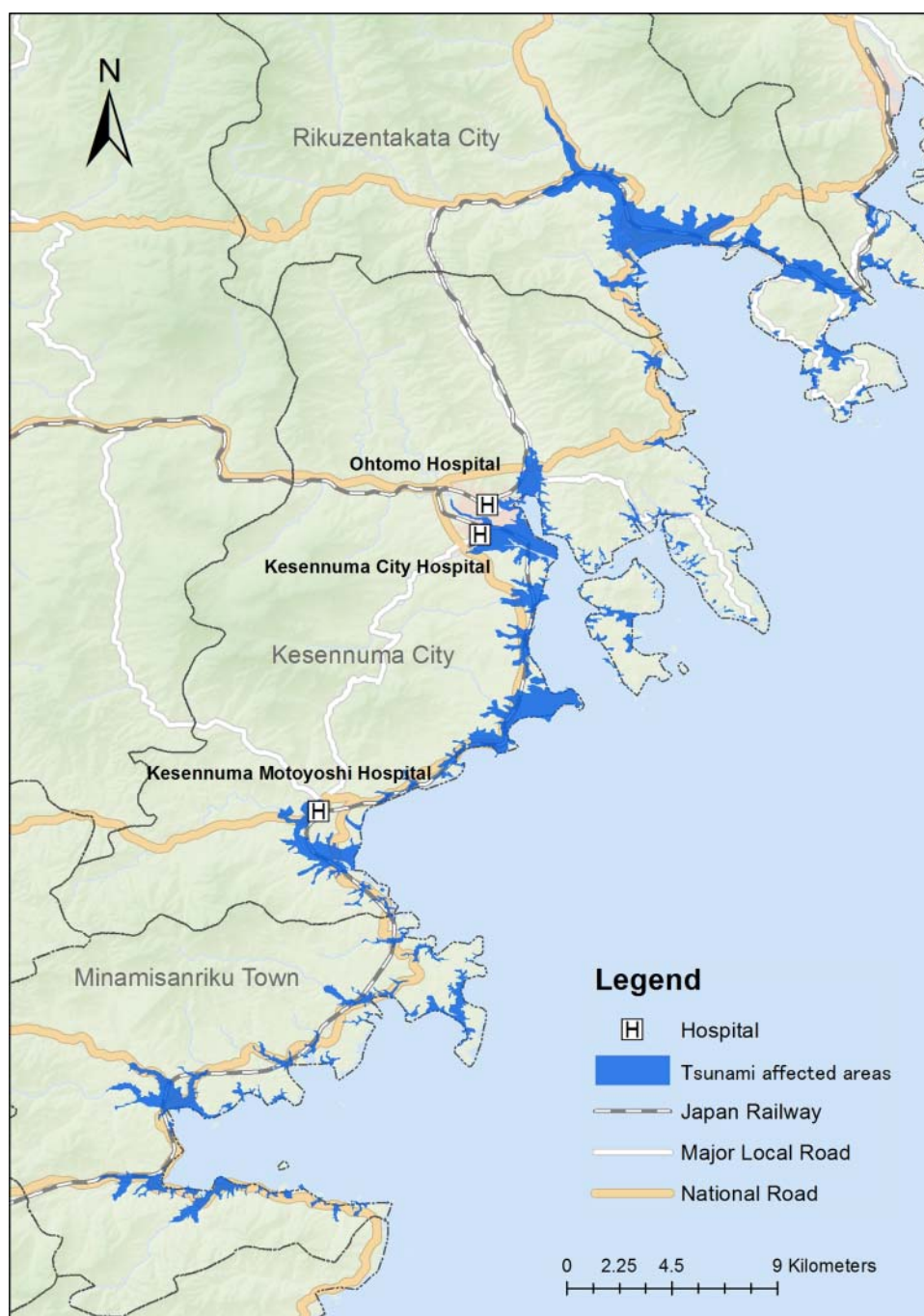
Figure 1 Area affected by the Tohoku earthquake and tsunami, Kesennuma City, Miyagi Prefecture. The disaster area data were obtained from the overview map of tsunami-affected areas released by the Geospatial Information Authority of Japan ( http://www.gsi.go.jp/BOUSAI/h23_tohoku.html ).

Kesennuma is located on the northeastern coast of Miyagi Prefecture (figure 1). The city has a long, saw-toothed coastline with narrow, flat land facing the Pacific Ocean. The total population in February 2011 was 74 257 (source: Department of