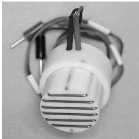
FIGURE 1: Wire type of electrode for electroporation.

cultured in \alpha -MEM containing 10% FBS together with antibiotics. One day before electroporation, the NOS-1 cells were prepared to loose confluence in a 60 mm culture dish. After passage, the NOS-1 cells were seeded in a 35 mm glass-bottomed culture dish (number P35Gcol-1.5-14-C, MatTek Corp., MA, USA) at a density of 5 \times 10^5 cells (each group: three dishes), and \alpha -MEM containing 10% FBS without antibiotics was used for culture in a humidified incubator at 37°C in an atmosphere of 5% CO 2 and air.