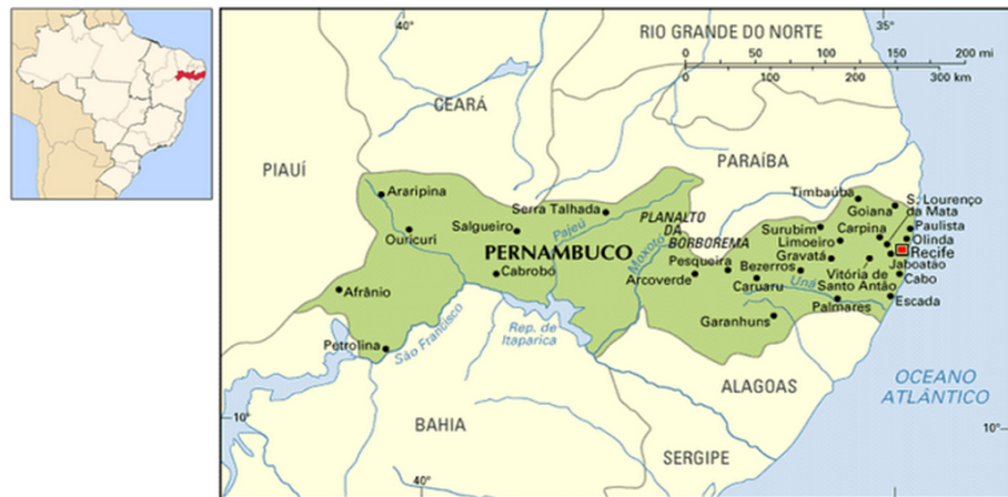
8. Map of the Federal State of Pernambuco and the Capital City of Recife

a coastal city of towering skyscraper residences, hotels, open air markets, historic architecture sites and informal settlements that are transected by the two main rivers that run through the city. Informal settlements cover expansive patches of the center city, line the riverbanks and exist in the shadows of the gated high rises. The sprawl like patchwork throughout the whole city. Informal markets selling churrasca , hair and nail services, dishes and pots, shoes and clothing sprawl adjacent to mega-malls, grocery stores and gas stations. More recently, migrants have