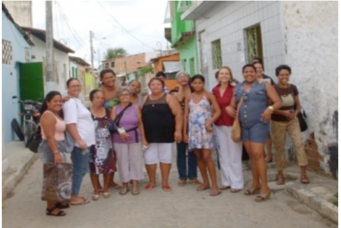
12. Espaço Feminista in front of Santo Amaro branch office.

Ultimately, gender empowerment work should not be the work giving women tools to better cope with oppression, but of fundamentally undoing the structures that govern women and men's relationships that are unequal.