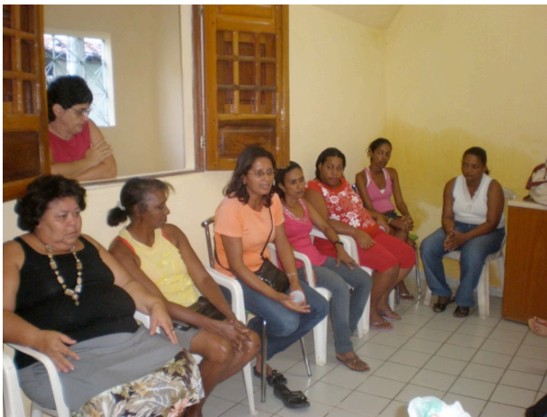
11. Meeting of Espaço Feminista at the Santo Amaro Branch office.