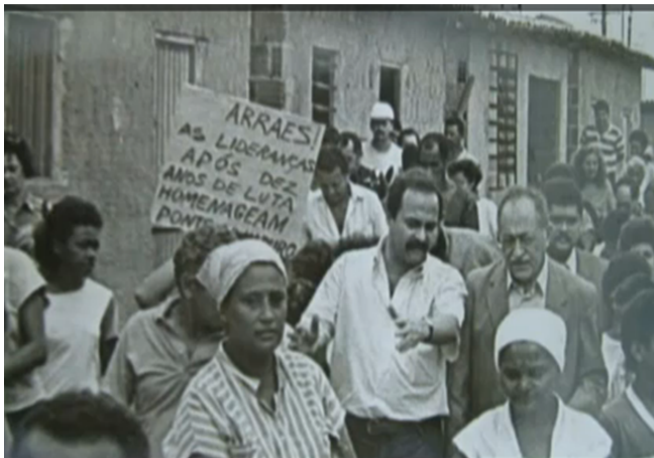
3. Gov. Arraes tours the conditions in Ponte do Maduro.

The movement for land regularization waxed and waned over half a century. In the 1960's the movement fomented and attracted the attention of socialist governor, Miguel Arraes de Alencar for the state of Pernambuco. Arraes promised to give titles to the four communities and ensure access to water, sanitation, electricity, cement buildings and street widening in the year before the military coup of 1964. During the 21 years of dictatorship from 1964-1985, Arraes was forced into exile and his promise was stifled. The movements for land regularization