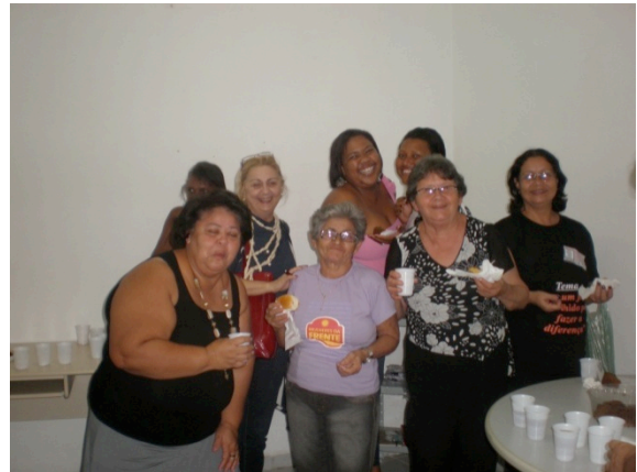
4. Espaço Feminista’s resident activist at the opening of the Sto. Amaro branch office.