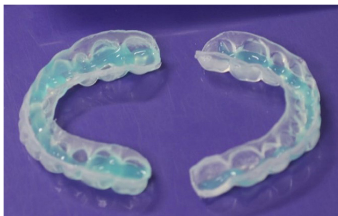
Figure 1 0.145% fluoride gel loaded in a custom tray, to be worn by the study participants at bedtime.

In 2017, regulations allowed the use of the highest concentration of 0.15% fluoride in Japan. Although it is about 1/10 of the concentration used in other countries, we aimed to obtain the same effect by extending the action time of the fluoride. First, we investigated the incidence of dental caries in head and neck cancer patients who had not received fluoride. The mean of new dental caries 1 year after RT in 31 patients with head and neck cancer undergoing RT was 2.68, while no newly developed dental caries was found in 25 patients with oral cancer who underwent surgery but not RT 1 year after the surgery. 6 Next, as a preliminary study, 13 patients with head and neck cancer undergoing RT received topical application of 0.145% fluoride gel in custom tray during sleep every day for 1 year (figure 1), and as a result no newly developed dental carious lesion was found in all 13 patients. 7 These results show that application of low concentration fluoride gel in custom trays during sleep every day is promising preventive method for radiation-related dental caries. Therefore, we conduct a randomised controlled phase III study (FluCar study) to evaluate the efficacy of low concentration fluoride gel using custom