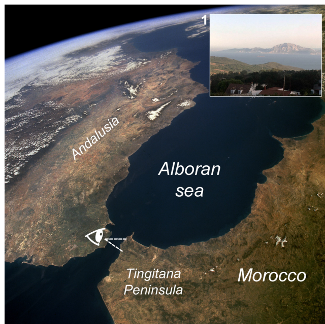
Figure 1: Satellite view of the Strait of Gibraltar in the geographical framing of southern Iberia and Northern Morocco. NASA archives. (1) in the upper-right angle, detail of African shore (Jebel Musa) from Andalusian (Tarifa) territory (2020, RMMS).

The first pottery recorded on the Maghreb coast, within a reliable chronological range, was found on the Tingitana peninsula. The ceramic assemblage includes mainly impressed vessels, many of which are