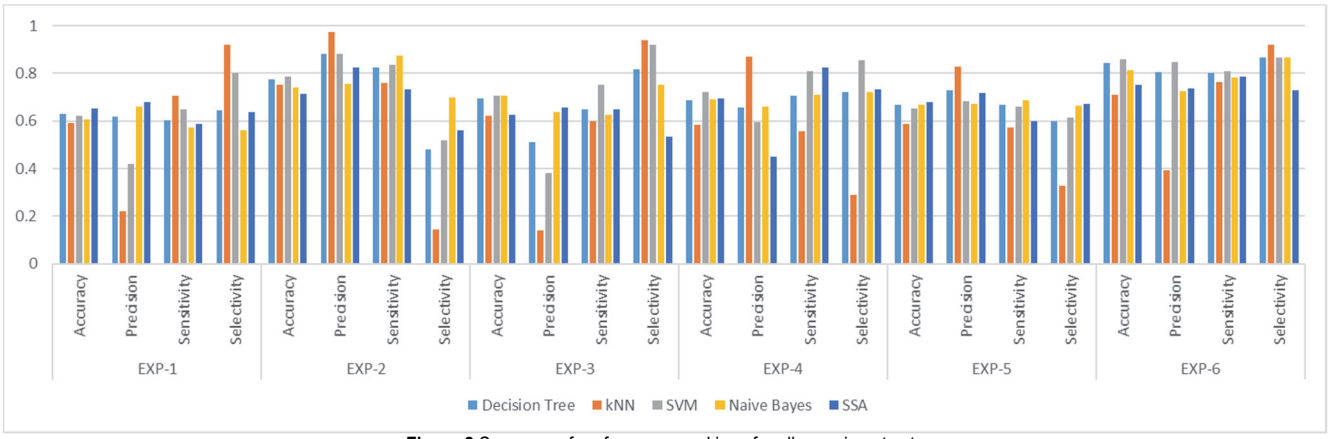
Figure 2 Summary of performance rankings for all experiment sets

The model generated by SSA for the six experimental datasets showed the best accuracy value in the first and fifth experiment sets, and the best precision values in the first and third experiment sets. SSA achieved the best sensitivity value in the fourth set of experiments, and the best selectivity value in the fifth set of experiments. It is therefore predicted that the performance of SSA in SA may increase if the initial parameters of the SSA are accurately set, that feature selection is performed, cross-validation is performed, or the number of models for the classes is increased. Different similarity metrics may also affect the results. Performance rankings of all experiment sets are summarized in Fig. 2.