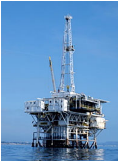
Fig. 2: Offshore oil platform located off the California coast

Some of the offshore oil and gas platforms have small seawater desalination facilities already in operation producing fresh water for platform personnel and equipment. Their existence demonstrates the technical feasibility of seawater desalination on offshore facilities.