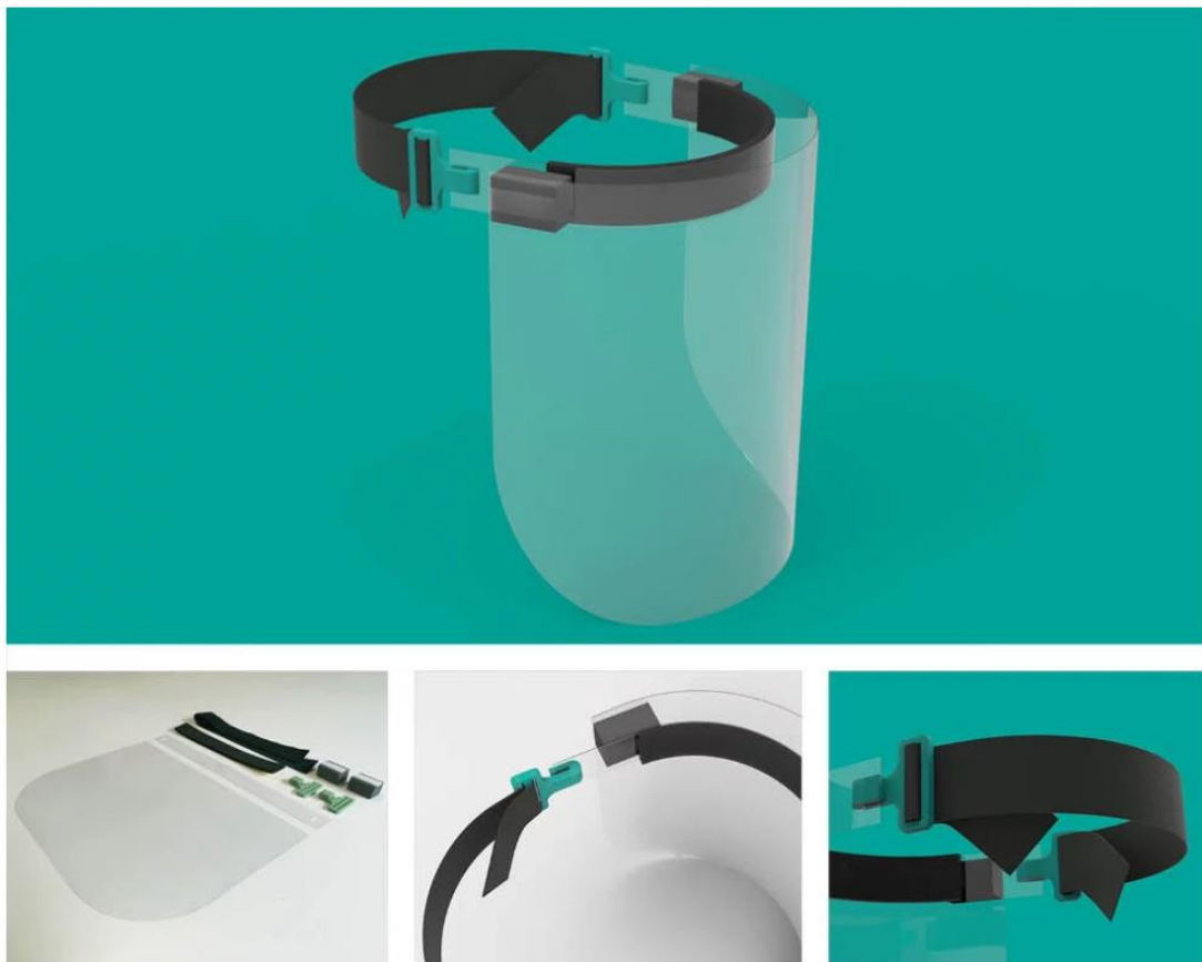
Figure 1: VI-GUARD adjustable face shield designed to address the lack of female-specific PPE

Building on this need for an adjustable low-cost face shield/visor for female health professionals, this paper reflects upon the design thinking approach used to develop VI-GUARD, an adjustable face shield (Figure 1), which has been designed using user-centred design activities to address the lack of female-specific PPE.