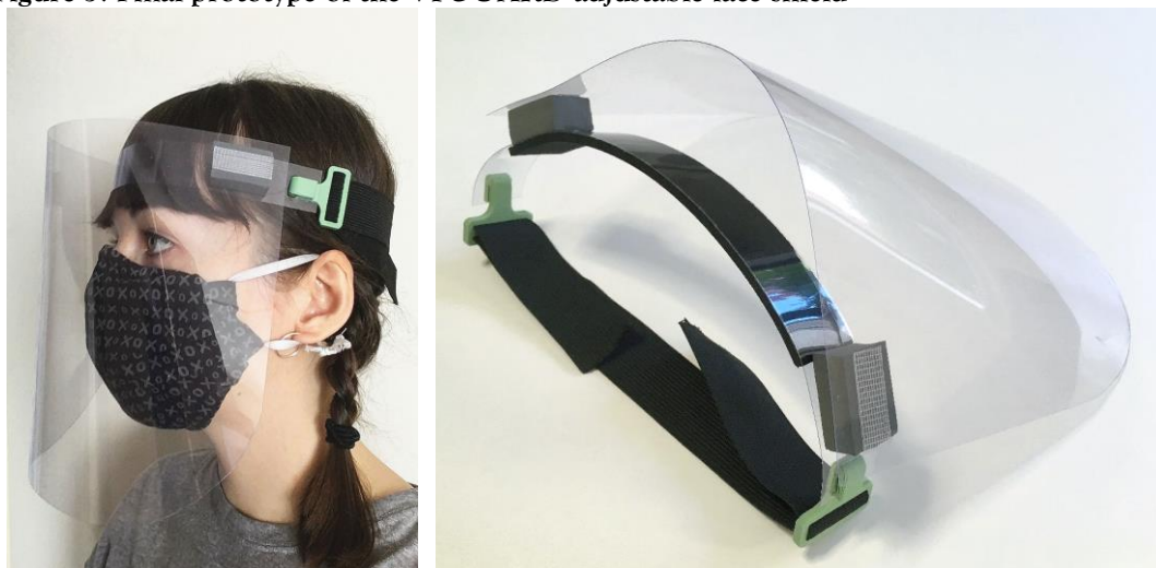
Figure 3: Final prototype of the VIGUARD adjustable face shield*

* The individual modelling in Figure 3 granted the authors permission to use her images in this paper.