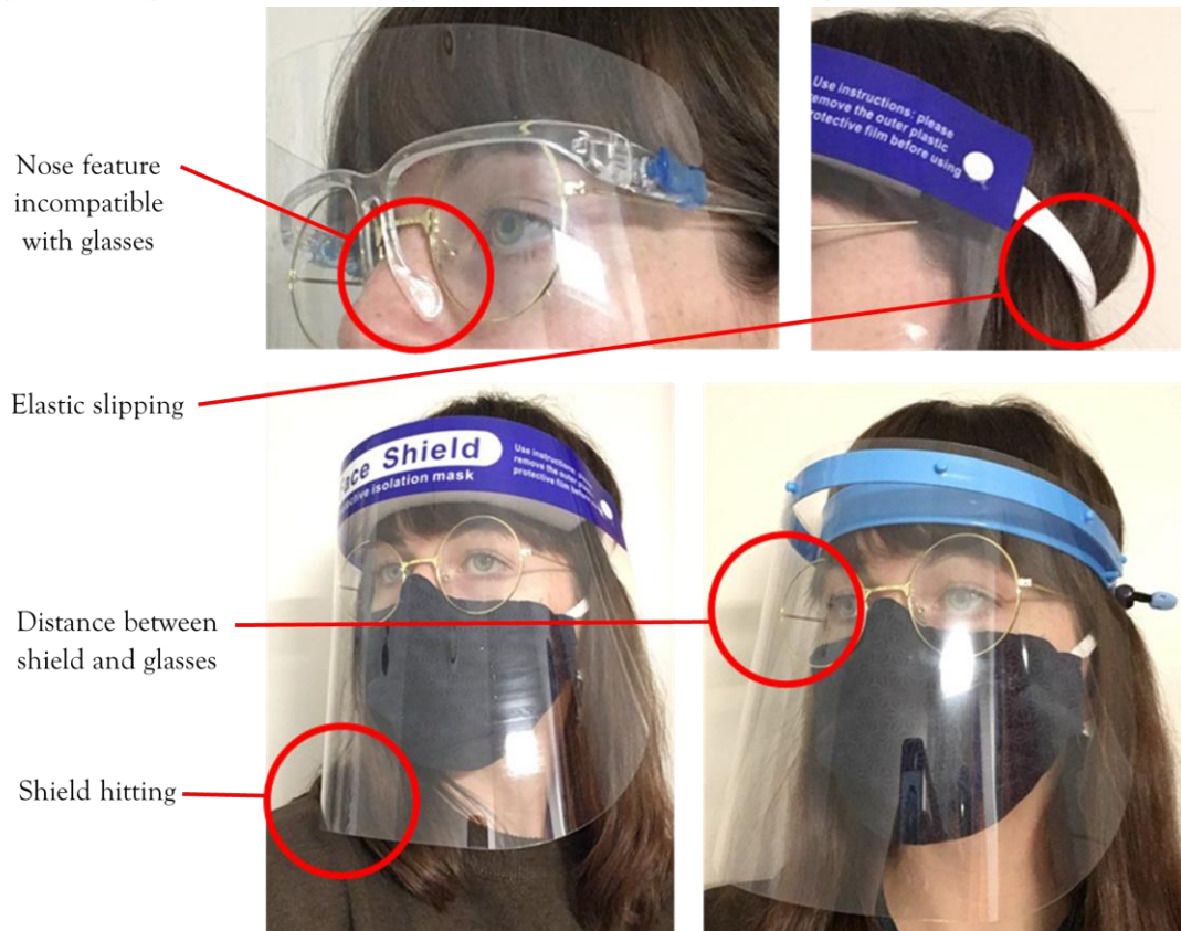
Figure 2: Empathic research using face shield to identify key design flaws and issues*

* The individual modelling in Figure 2 granted the authors permission to use her images in this paper.