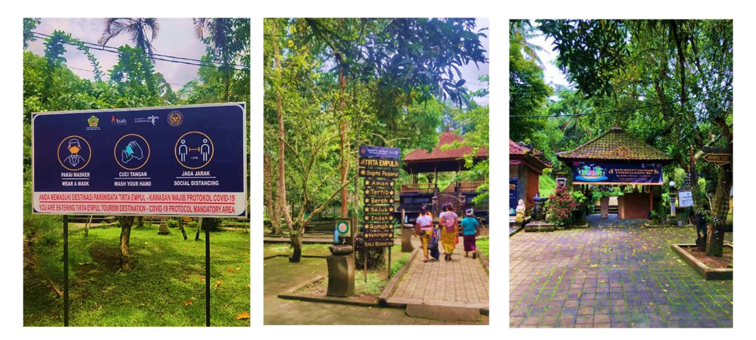
Figure 1. Ministry of Tourism and Creative Economy assistance to Tirta Empul Temple related to the reopening of Tirta Empul Temple in accordance with the Health Protocol.