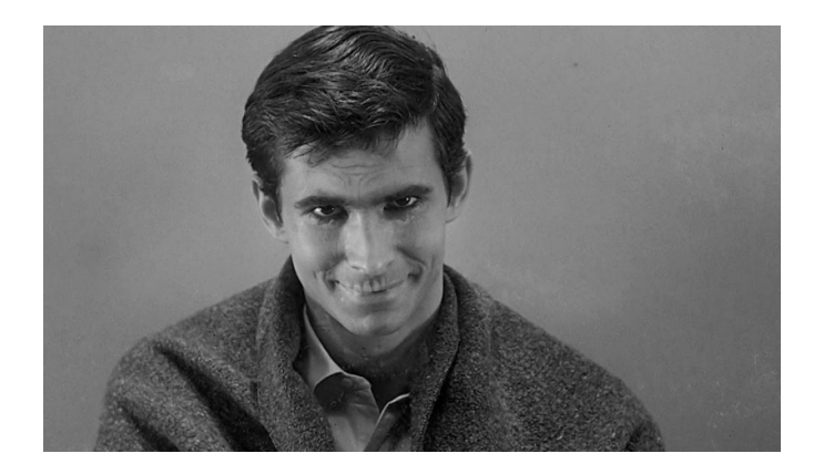
Figure 2. Norman/Mother returns the gaze in Psycho.

On this point Psycho is of course exemplary, involving as it does an effective identificatory 'drift,' insofar as after the filmic fantasy is thrown into turmoil with the unexpected death of Marion (introducing a hole in the text by literally cutting at its heart), the narrative focus is condemned to 'traverse' from one character to the next (Marion, Norman, Lila, Arbogast, Sam...) to the point that the very question of identification is voided .<sup>28</sup> Indeed, following the failed attempt by the psychiatrist – who Lacan himself sarcastically observes to be "endowed with all the features of the untouchable" (2017, 13) – to restore the smooth operation of fantasy (and thereby halt narrative metonymy by providing an 'answer' to the enigma of the Other's desire), the final locus of 'identification' turns out to be none other than 'Mother' herself, the void subject par excellence , whose impenetrable stare (superimposed over the figure of Norman in the film's penultimate shot) belies the very possibility of identification (Figure 2).