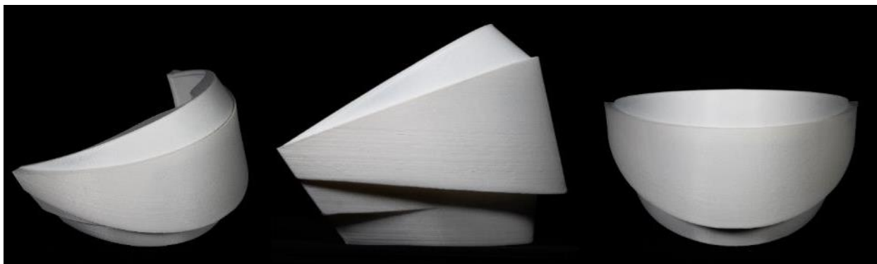
Figure 13: Cecconi, Eleonora, First prototypes printed in PLA with Ultimaker printers, photo by Filippo Giansanti and Paolo Formaglini, Laboratorio Fotografico di Architettura. 2020