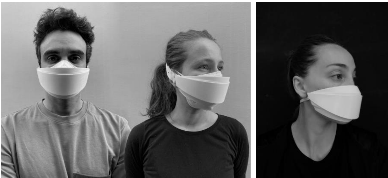
Figure 17: Beni Niccolò, Sedda Antonella, 'Test for wearability of the 'cover' mask'. 2020