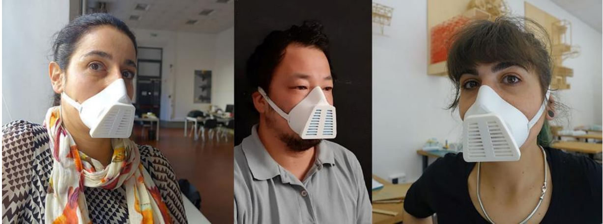
Figure 16: Verdiani, Giorgio, 'pictures taken during the test for wearability of a 3D printed mask'. 2020