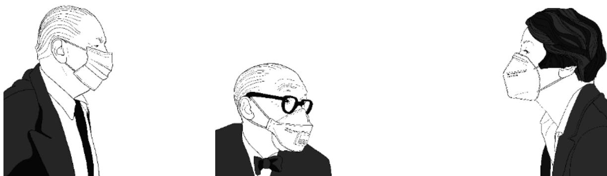
Figure 3: Cecconi, Eleonora, 'The surgical face masks protect from inside to outside'. 2020