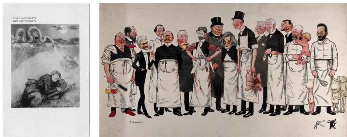
Figure 1: Raemaekers, Louis, 'The gas Fiend', Raemaekers' Cartoons. Doubleday, (1917:57) https://doi.org/10.5479/sil.417696.39088007053556 .