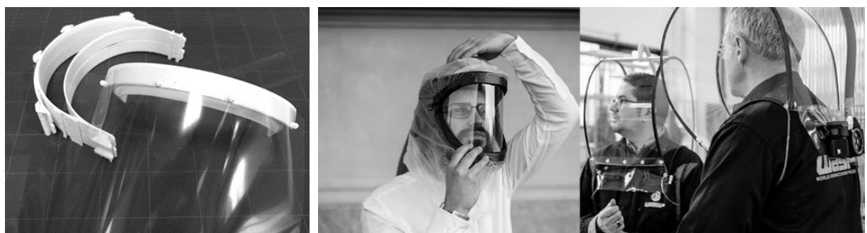
Figure 8: Algostino, Francesco, 'Josep, 'Prusa's face shield' Sample printed in Laboratorio Modelli per l'Architettura. 2020