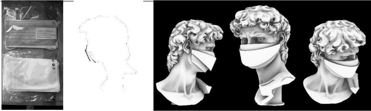
Figure 10: Algostino, Francesco, 'Masks made in Tuscany'. 2020