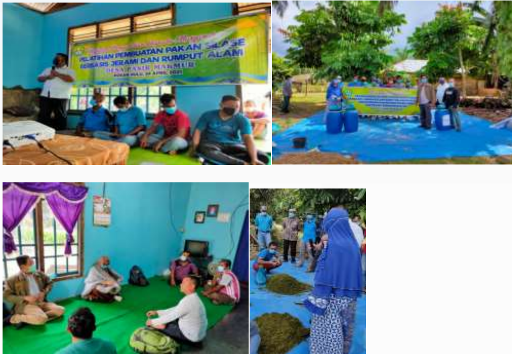
Figure 3. Training Conditions for Silage Feed

From the supporting factors of the training activities, the direct impact that can be felt by the community is providing information about investment opportunities in the field of animal feed processing which is very potential, providing information and knowledge to develop livestock business, especially silage and biogas feed processing, especially in the community, while the impact is not Direct was an efficient and sustainable business model for making silage and biogas feed. The conditions during the training can be seen in the image below