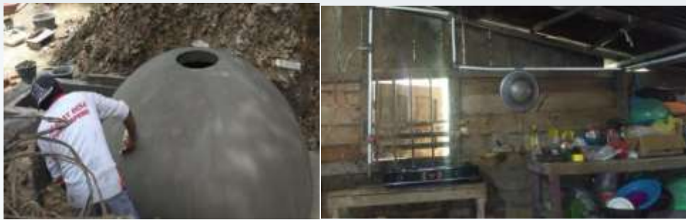
Figure 2 . Biogas production and product technical

The following is a picture of biogas processing that comes from cattle dung. The construction of biogas installations that have been done by the service team are as follows