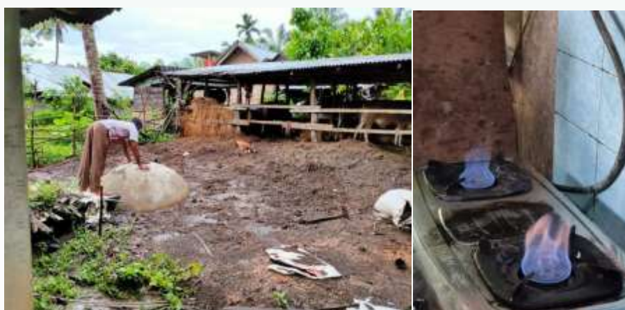
Figure 4. Training Conditions of Biogas

Figure 4 shows the training process for making biogas and the biogas products that have been produced