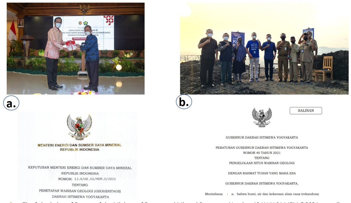
Figure 3. a. The Submission of Decree of the Minister of Energy and Mineral Resources Number 13 K.HK.01.MEM.G.2021 regarding the annihilation of 20 Geoheritage Sites in DI Yogyakarta by the Head of the Geological Agency to the Governor of DIY on 22 April 2021 (ESDM, 2021) and a copy of the decree; b) Pledge of commitment by the Gunungkidul Regent and the Head of the Gunungkidul BPD Bank in their commitment to maintaining and implementing the DIY governor's regulations regarding the use of geoheritage areas, one of which is Gunung Ireng and a copy of the governor's regulation No. 40 year 2021