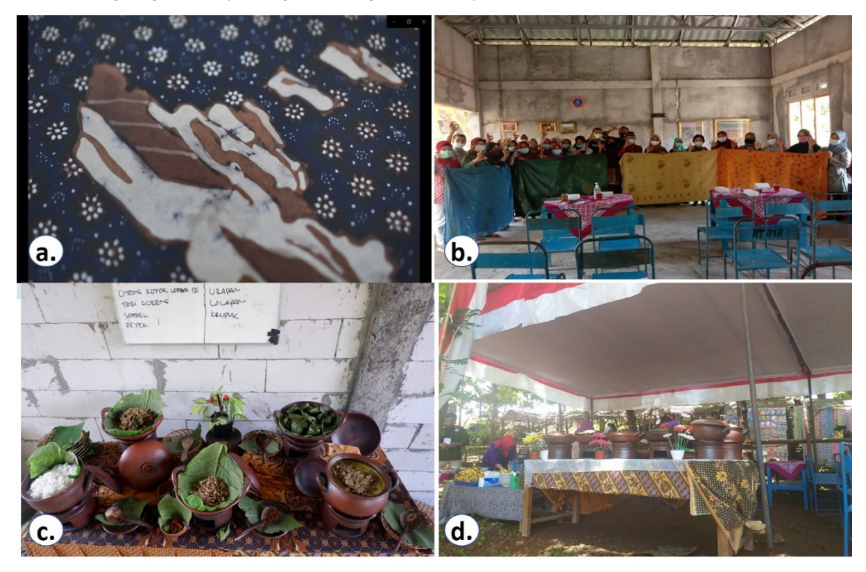
Figure 4. Some of the amenities that have been successfully added during the activity: a) The aesthetic Gunung Ireng's batik developed using local andesitic thin section motif (photo taken in 2019); b) The batik's implementation (photo taken in April 2021); c) Various menus that available at Gunung Ireng (photo taken on 2020, 9 January); d) Cafes and restaurants by order (photo taken on 2020, 10 March)

issued by the Ministry of Energy and Mineral Resources Number 13 K.HK.01.MEM.G.2021 (Figure 3.a), which is then followed up with the Regulation of the Governor of the Special Region of Yogyakarta