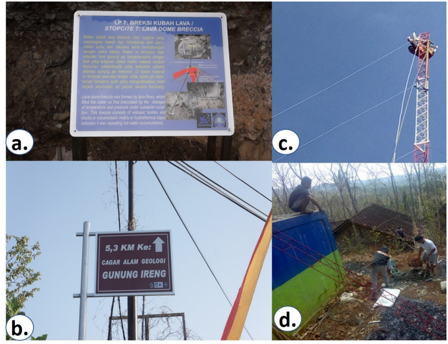
Figure 5. a) An example of a signboard installed at the Ancient Volcanic Museum (June 2021); b) The directional signboard (June 2021); c) Unlimited Microtik Wi-Fi (October 2019); d) Cultural signboard installation (October 2021)

access from various surrounding destinations, from Patuk District to the location. The Regent of Gunungkidul is highly committed to the sustainability of this community service activity. The implementation of the Corporate Social Responsibility (CSR) program from the Regional Government Bank (BPD) of the