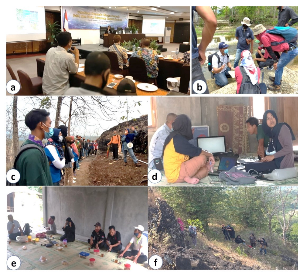
Figure 6. a) Classroom on geotourism guidance training (photo on October 2019); b) Training on interpretation tecniques (photo on October 2020); c) Intensive training on fieldwork guidance (photo on October 2021); d) Training on website and operating system (photo on May 2021); e) Motivation and mentoring on networking (photo on July 2021); f) Training on Photography (photo taken on May 2021)