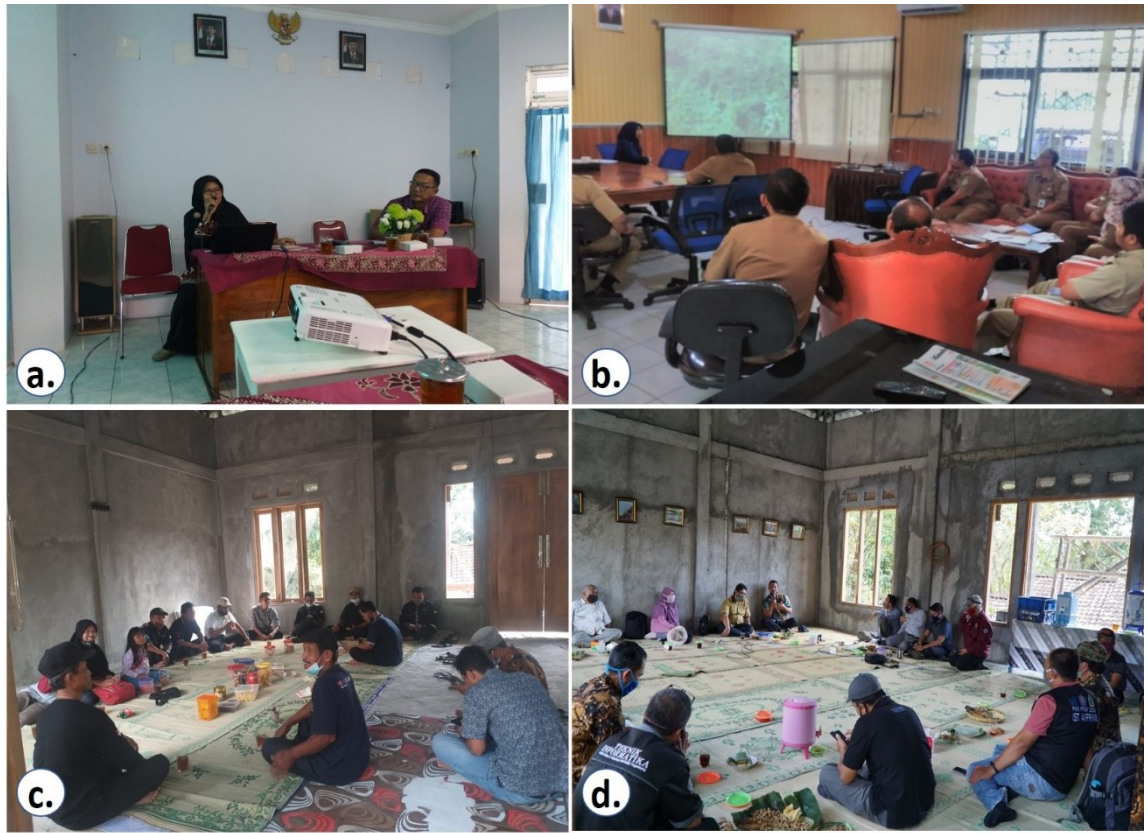
Figure 2. a) Presenting the results of research into the local government (May, 2019); b) Discussing the geotourism development with the Regional Research, Planning and Development Agency of Gunungkidul Regency (Juni 2019); c) Discussing the geotourism plan with the local community (June 2019); and d) Discussing the geotourism progress with the stakeholders and the local government (June 2021).

(Figure 2.c). The progress of Gunung Ireng is evaluated every Sunday night to explore the obstacles faced and brainstorm the best solution. (Figure 2.d). Organizational strengthening (POKDARWIS) is always monitored effectively, followed by planning activities in line with the vision, mission, and objectives of the Gunung Ireng Geotourism.