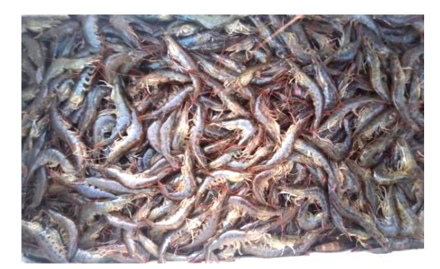
Figure 6. White leg shrimp production

After reared for 66 days, the shrimp reached an average size of 12.5 g per shrimp, and it could be classified into the fast-growing category. Suwoyo claimed that white leg shrimps harvested from extensive aquaculture and rearing duration of \geq 70 days could reach an average size of 10 g per shrimp. However, in this practice, shrimp harvest had SR level of <50%, which was categorized as a low level. It was assumed that it was caused by various factors, including poorly managed embankment preparations that might have been manifested in the existence of pests in the embankment when stocking.