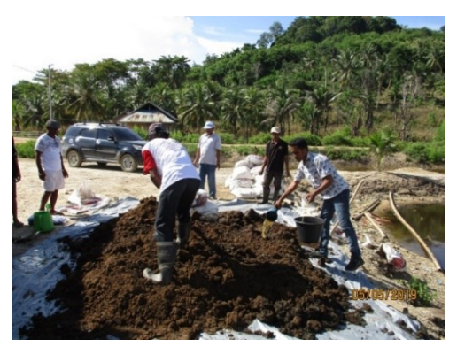
Figure 3. Organic fertilizer production

due to an extreme change of water quality, and this could be detected from the proliferation of hemocytes (Wangi et al. , 2019). Likewise, if there was toxic in the embankment water, such as heavy metals, they would accumulate in the shrimp's body and affect the growth of the fish (Kumala et al. , 2019).