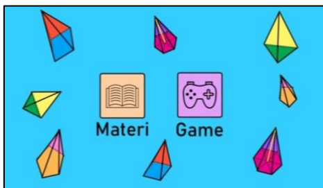
Figure 2. Main menu page

This page contains a material button that contains about pyramid topic, and a game button to start the adventure in pyramid multimedia games.