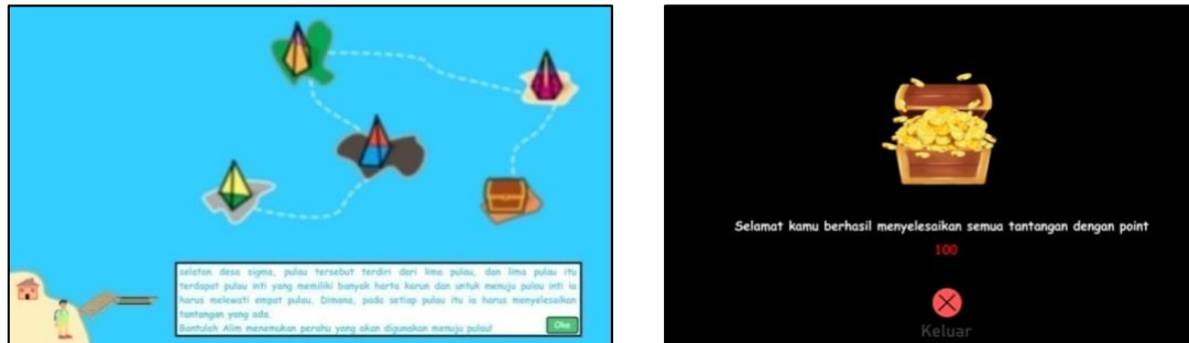
Figure 4. Game page

This page contains practice questions that are done in groups on each island, after completing the questions on each island the scores will appear automatically.