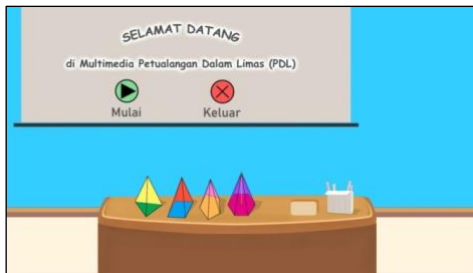
Figure 1. Welcome page

This opening page contains the start button to be directed to the main menu, and the exit button to exit the application.