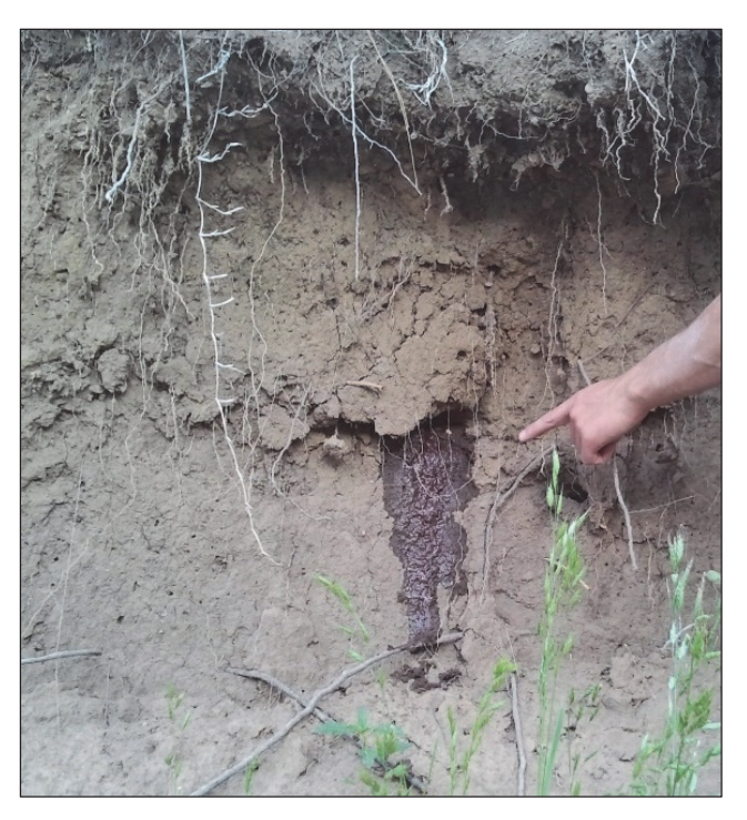
Figure 2. Macropores exposed on a streambank at the Barren Fork Creek site, with water and dye reaching the streambank during an infiltration experiment.

An invited session on "Preferential flow and piping in riparian buffers" was held at the 2020 ASABE Annual International Meeting. The session was organized to address topics such as mechanisms of PF in the vadose zone, PF in surface runoff, field and/or laboratory experiments, modeling PF, impacts of PF on flow and transport, and impacts of PF