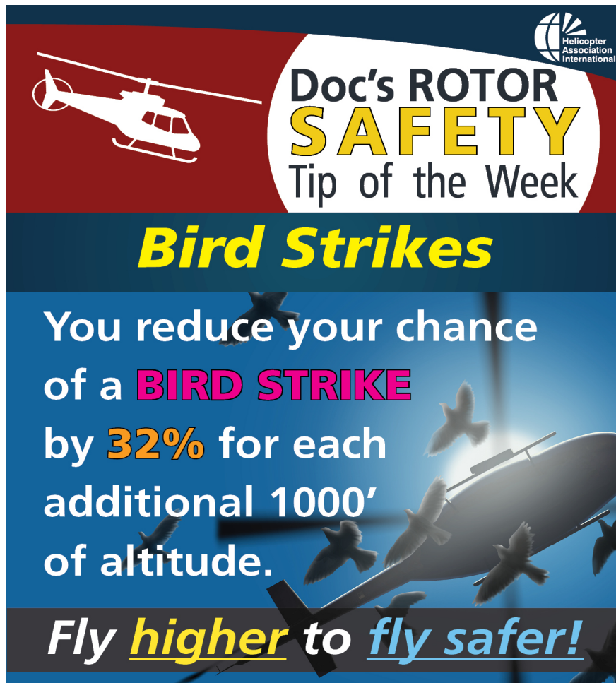
Figure 2. Safety poster produced in 2017 by Helicopter Association International based on published data from the National Wildlife Strike Database (Dolbeer 2006, Dolbeer et al. 2016).

For Parts 2 and 5, comparisons of each airport with regional and national means are made using adverse effect strike rates and not total strike rates. Total reported strikes for an airport is not a valid metric for measuring the effectiveness of the airport's WHMP because hazard levels of wildlife species struck vary among airports and some airports are more diligent than others in reporting all non-damaging strikes involving even the smallest of birds. For example, an airport reporting 10 strike events with swallows has a much less serious wildlife strike issue than an airport reporting 10 strike events with Canada geese. In contrast, adverse effect strikes are potential precursors to catastrophic events. Adverse effect strikes constitute a valid metric for measuring risk and provide a benchmark for individual airports to evaluate and improve their WHMPs in the context of a Safety Management System (Dolbeer and Wright 2009, Dolbeer and Begier 2012).