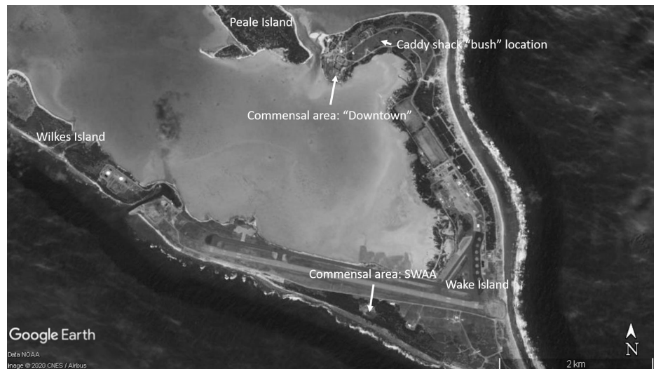
Figure 1. Wake Atoll showing trapping locations for the “downtown” commensal area, the solid waste aggregation area (SWAA), and the “bush” rat habitat around the caddy shack.