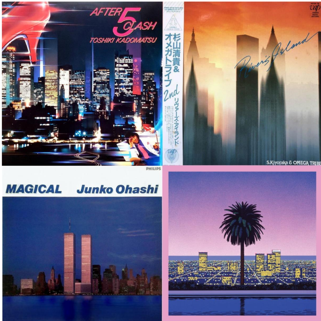
Figure 5. Themes of urbanism in city pop album art. Clockwise from left, Kadomatsu Toshiki's After 5 Clash (1984), Omega Tribe's River's Island (1984), Pacific Breeze 2: Japanese City Pop, AOR & Boogie 1972-1986 (2020), and Ohashi Junko's Magical (1984). 111