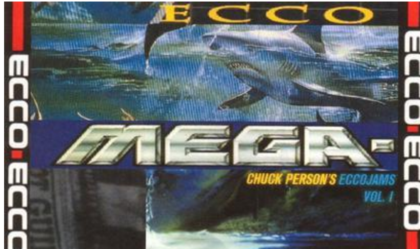
Figure 9. The cover of Oneohtrix Point Never's Chuck Person's Eccojams Vol. I 162

Chuck Person's Eccojams Vol. 1 the following year in 2010, an entire album of what he was now referring to as “eccoams.” 161