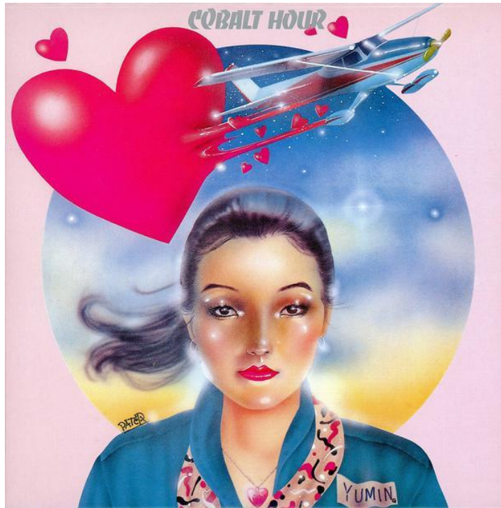
Figure 2. Album cover of Cobalt Hour (1975). 74

The album cover of her third effort, Cobalt Hour , was illustrated by Japanese artist Sato Pater, whose hazy airbrush illustrations would appear on four of city pop superstar Yamashita Tatsurō's later album covers. It features a prop plane bursting through a giant, red, cartoon heart. Standing below the plane is Arai Yumi, looking straight ahead at us with a wry smile. She appears to be dressed in the uniform of an airline stewardess, complete with blouse, scarf, and nametag. With her ponytail blowing in the wind, she welcomes us on a journey. A ring of blue, star-spangled sky hangs behind her, with a flash of yellow beneath it the color of beach sand. From this period onward, exotic travel would grow in significance as a symbol of city pop. The titular opening track " Cobalt Hour ," creeps in with the rumbling engine of a prop plane gradually