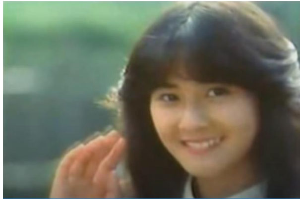
Figure 8. The final image of OPN’s “Angel.” The lyrics “I miss you when you’re gone” repeat as the image slows and cuts to black. 159

The scene then transitions to other Japanese commercials, including a bikini-clad woman using a camcorder on a beach (figure 7, bottom right). It closes with a teenage girl slowly walking through a forest with a boombox. She turns her head to face the camera, which OPN edits to repeat many times. The girl smiles and waves at the viewer in slow motion as the song and image smash cut to silent blackness. 158 The mix of the loneliness of the lyrics with the images of technological opulence and the artificial smiles of TV commercials would become a common juxtaposition utilized in vaporwave art and music. As the lyrics, “I miss you when you’re gone” play over the final image of a girl waving, the commercial, intended to be alluring, instead becomes one in which the girl is waving goodbye to something. In slow motion, her innocent smile becomes something foreboding.