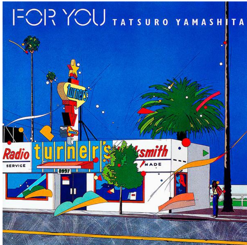
Figure 4. Suzuki Ējin's artwork for For You (1982), evoking 1950s Americana and beachiness. 108

A city pop movement had fully coalesced around Yamashita Tatsurō. Hagiwara describes it as something of a phenomenon: