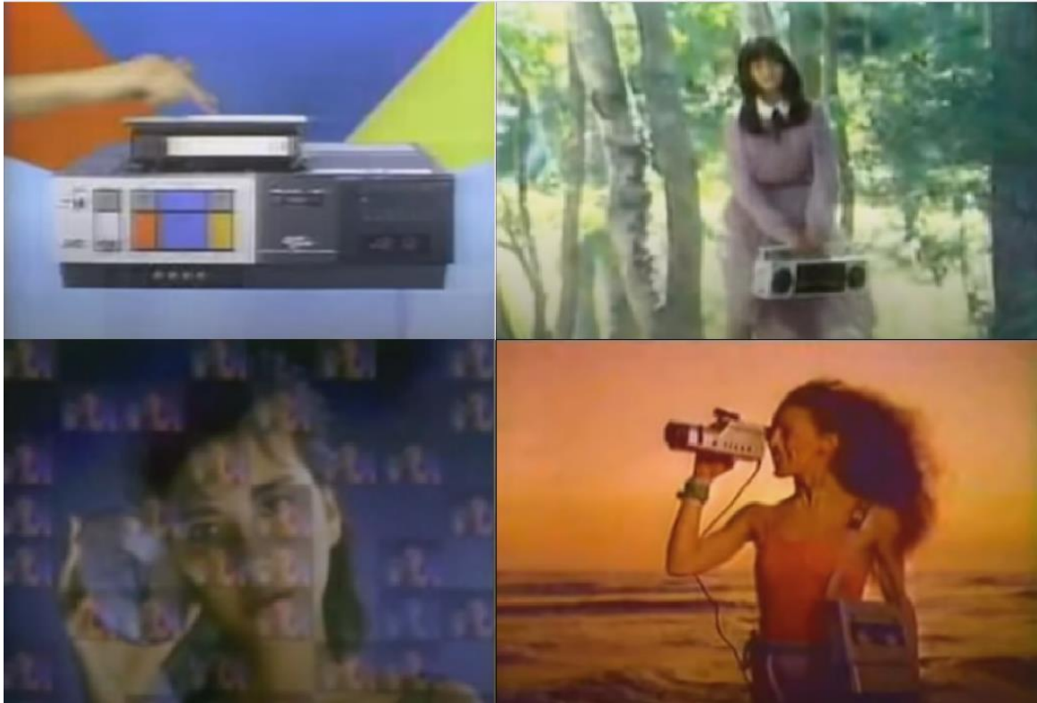
Figure 7. A collage of images of 1980s Japan from Oneohtrix Point Never's Memory Vague 155

The second track on Memory Vague , “ Angel ,” is created entirely out of an 11 second sample of the 1982 Fleetwood Mac song “ Only Over You .” The sampled section can be heard at the 48 second mark of the original song. 156 The sampled lyrics are rendered as: “I miss you when you're gone; they say...Angel please don't go.” 157 OPN shuffled the lyrics around from their original order, changing the syntax and increasing the sense of ennui. The sample is replayed and glitched at various pitches and speeds for a minute and a half. The visual element of the track opens with footage of a 1980s Japanese TV commercial for a multicolored Sony tape deck (figure 7, top left). As the loop plays underneath, a disembodied hand opens and closes the deck over and over as the video sample repeats. Images of remotes and cables flash for milliseconds.