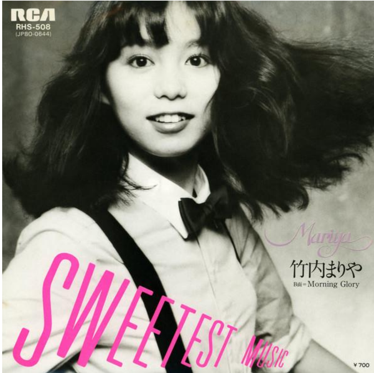
Figure 10. The Cover of Takeuchi Mariya’s Sweetest Music , which is used in the thumbnail for the popular video on YouTube for “Plastic Love.” 190

population of young people still feeling the effects of the late 2000s recession.