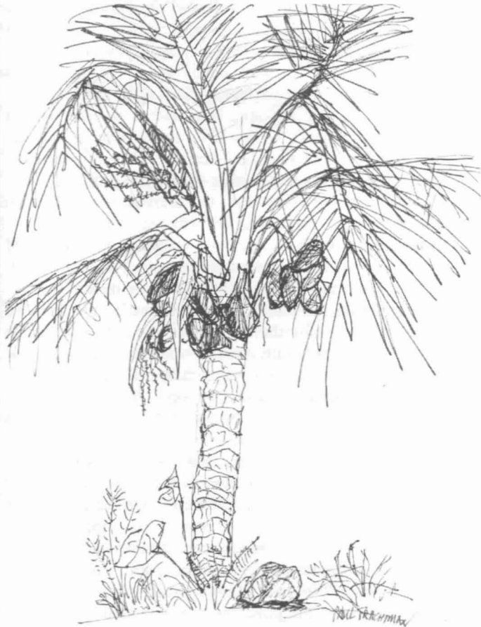
From the sketchbook of Paul Trachtman.

Among the Rapanui, renewal of their culture and return of their land are strands of one story, like fibers pounded into one sheet of tapa. But different voices tell the story in very different ways. At the Hotel Orongo one evening, a group gathers to tell