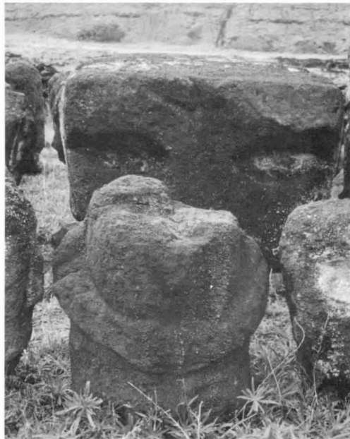
Statue fragments found in the rubble of Tongariki's ahu. Note arm position in front moai, very similar to those from other parts of Polynesia.

and has had a forlorn overgrown look. Recently the Municipalidad provided empanadas and soft drinks and enlisted the help of local school children who cleaned up the site, cut the grass, and improved its appearance 100%. Congratulations to Alcalde Edmunds and the Rapa Nui school kids.