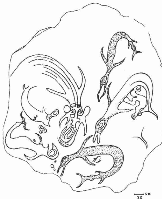
Figure 2. Rano Kau's spectacular panel before vandals carved initials into it. The panel is 5 meters across. Deeply carved designs—some in intaglio—swirl around the boulder. The large bearded face on a fish body is similar to some that are carved on the heads of wooden kavakava figures.

and field notes (Lee 1992). Using the earlier research as a control, several sites were selected for assessment: these