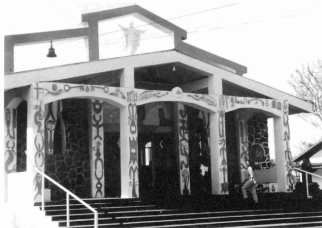
Hanga Roa's church has a new coat of paint which shows off the rongorongo carvings on the exterior.

• The most prominent of the new supermarkets is a “hipermercado” built by former governor, Sergio Rapu. It is modeled after the Ala Moana center in Honolulu with a covered courtyard and small shops opening into the “mall”. Called Tumu Kai (roughly, Foods for the Family), it is the first to feature pushcarts and serve-yourself shopping. It has a meat market, bakery, and a deli in preparation along with a sushi bar. Rapu plans to feature fresh local products. Islanders consume 90 tons of chicken a year—all coming from Santiago, along with eggs and meats. It is estimated that $400,000 to $500,000 leaves the island yearly for food. The island needs to raise its own chickens, eggs and pigs, instead of bringing them in from the mainland, and this is one of Rapu’s goals. His store features locally made guava jam. The label has a moai on it and should be a great tourist item to take home (we bought some!)