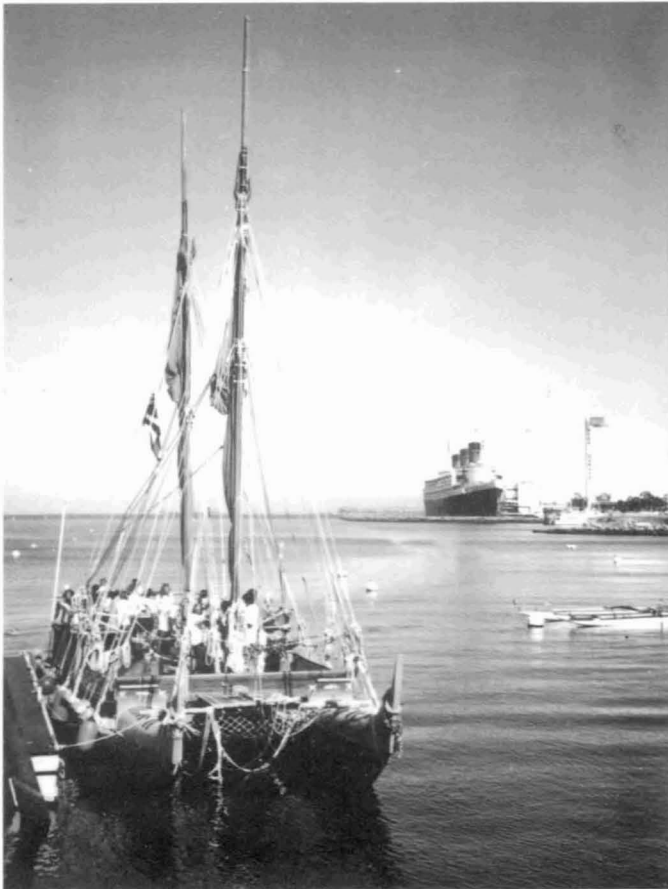
The Hokule'a at Long Beach Harbor. Note the Queen Mary in the distance.

The Hokule'a arrived into Long Beach harbor on July 12th and was escorted in by boats and canoes including one canoe with Rapanui islanders, many of whom had flown in just for this occasion. During the following two days a community forum was held accompanied by a week-long celebration of