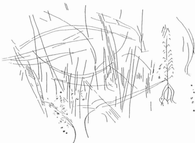
Figure 1. Petroglyph at Hanga Piko that appears to represent a large tree. Drawing shows the panel prior to its being vandalized.

Sites with petroglyphs on ground level lava flow ( papa )