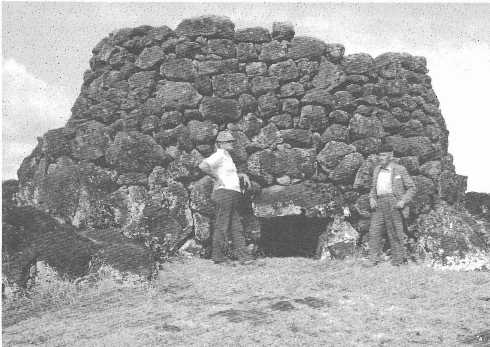
Ko te kura hihi at Hanga Ho'onu, La Perouse Bay, is one of the best-constructed and best-preserved of Easter Island's tupa. The men in the photograph are Rafael Haoa and the late Jose Fati.

On the Rapanui word momoko , Mrs Mulloy said - seemingly correctly - that it is related to moko 'lizard', a word which 'also occurs widely in Polynesian languages'. She added that complete or partial reduplication is common in those languages and that it usually has the effect of 'forming a plural, showing repetitive action, or simply emphasizing the term employed'. According to Englert, momoko means 'something shaped like a lizard' and, by extension, 'anything with a pointed, slender shape'.