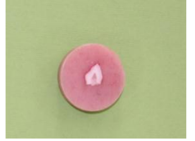
Figure 2- Sectioned and polished tooth embedded in acrylic resin

All groups were incubated in microaerophilic conditions at 37°C for 14 days. The media were refreshed every 48 h and specimens were transferred to a new medium. After completion of this time period, the teeth were removed from the media and prepared for microhardness evaluation (12). Microhardness indirectly shows the mineral content of enamel and dentin; thus, this test was used for assessment of changes in tooth surface. To determine microhardness, tooth surface at the window area was vertically divided into two segments. The obtained piece was embedded in acrylic resin in a way that the entire tooth surface except for the sectioned area was covered. Prepared specimens were polished with 600, 800 and 1200 grit abrasive paper discs. Final polishing and finishing was done using a solution containing 0.5 and 0.03 mM aluminum oxide particles and a special cloth (Figure 2).